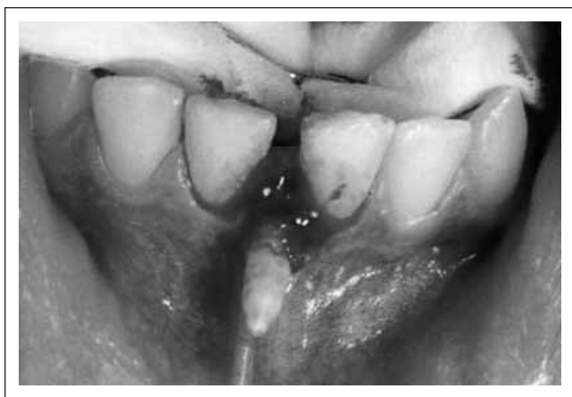
Figure 3. Surgical procedure using a manual instrument.