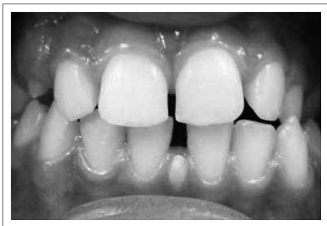
Figure 1. Conical single mesiodens partially erupted.