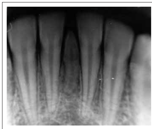
Figure 2. Periapical radiography showing a rotated mesiodens with an apex dilaceration.