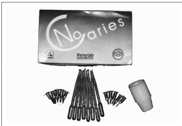
Figure 1. No Caries® saliva test.

In the Eastman interdental bleeding index (IBI) 14 each tooth was assessed for the presence or absence of bleeding. An interdental toothpick was inserted along the vestibular face of each tooth of the arch, parallel to the occlusal plane, pressing the gingival tissues about 1 to 2mm and taking care not to direct the end of the toothpick apically. The toothpick was inserted and removed 4 times in each interproximal space, and after 15 seconds the presence or absence of bleeding was noted. During this examination, the child continued lying in the same above-mentioned position.