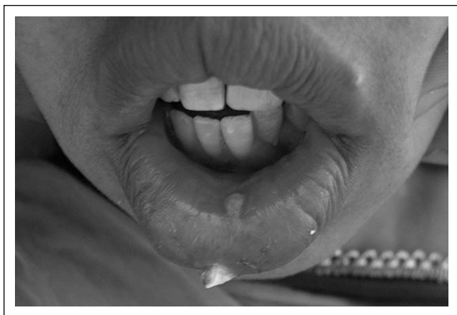
Figure 1. Lower lip showing presence of extruding foreign body and mucocele