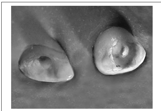
Figure 2. Under absolute isolation, note the increased coronal access.