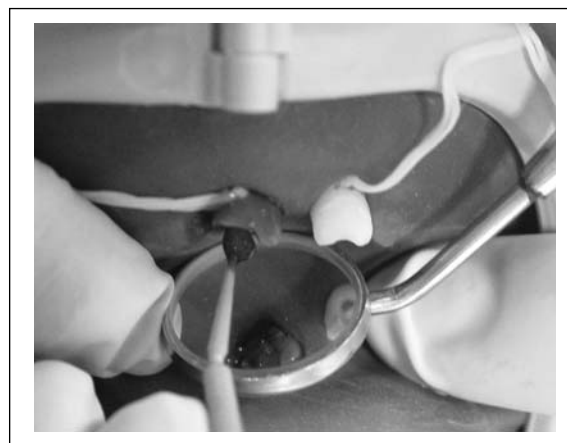
Figure 4. Application of the product internally and externally with aid of a microbrush; photoactivation for 40 seconds on each surface of the teeth (palatal and vestibular) waiting for complete discoloration of the material.