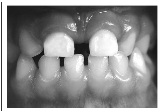
Figure 6. Final aesthetic results.

obtained. Under absolute isolation, the root canal access was widened and a plug of Vidrion-R glass ionomer cement with 2mm thickness was inserted and access was sealed with a glass ionomer modified resin (Figure 2). In another visit, internal and external bleaching was done simultaneously. To do so, soft tissues were protected with solid petroleum jelly. After absolute isolation we removed the provisory seal and pumiced both teeth. We then placed Whiteness-HP (FGM) with a proportion of three drops of hydrogen peroxide to one drop of thickener (union of these two materials forms a dense purple colored paste to be placed on dental surface to be bleached) (Figure 3). 1,0mm thickness application of the product is done internally and externally with the aid of a microbrush. Photoactivation with an Optilight Digital, for forty seconds was done on the palatal and vestibular side of the teeth, waiting for total discoloration of the material (Figure 4). We then proceeded to remove the material washing it with abundant water and observing the color