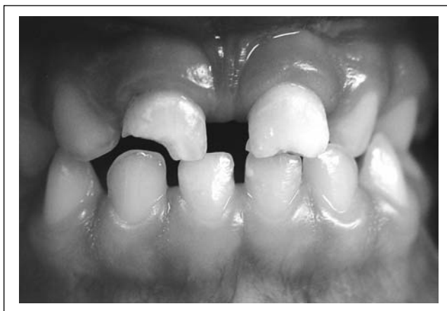
Figure 1. Initial aspect of maxillary central incisors of a three year old patient with color alterations more pronounced in tooth 51 and presence of coronal fractures without pulpar involvement and vestibular hypoplastic stains compromising teeth 51 and 61.

A week after endodontic treatment, both teeth received a pre-bleaching treatment consisting of prophylaxis, initial color verification using VITA shade, obtaining color A 3,5 for tooth 51 and color A2 for tooth 61. Photographic documentation was also