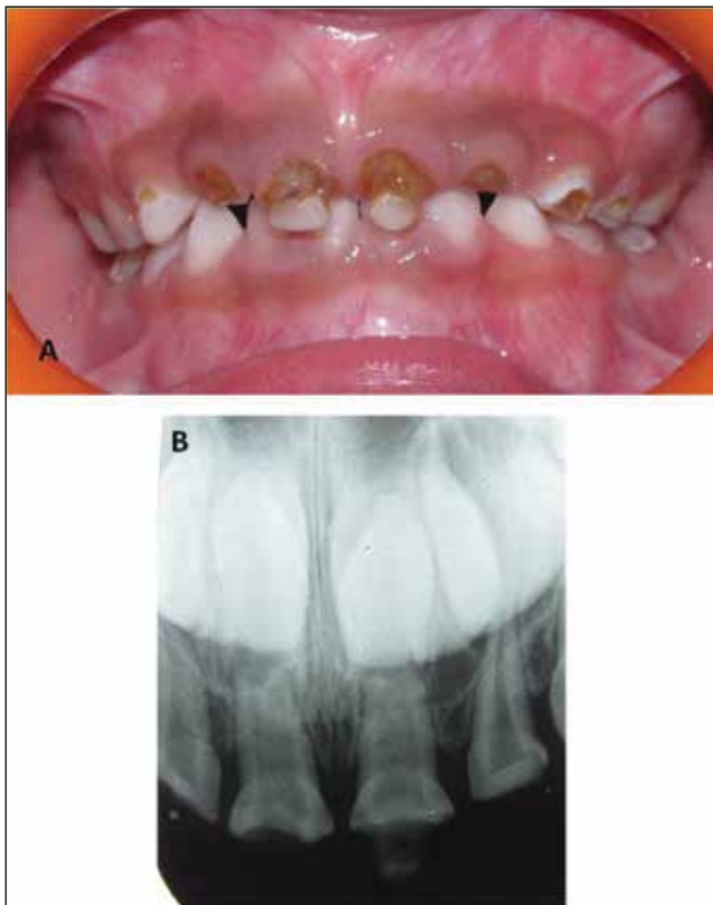
Figure 1. A- Frontal view of maxillary incisors B- Initial radiograph of the anterior primary teeth