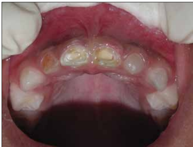
Figure 2. Sealing of the root canals with glass-ionomer cement after endodontic treatment