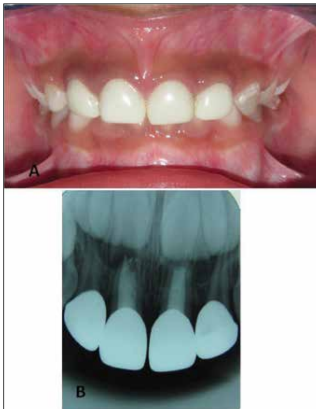
Figure 5. A- Final view after crown cementation B- Radiograph showing endodontically treated maxillary central incisors and cemented zirconia crowns