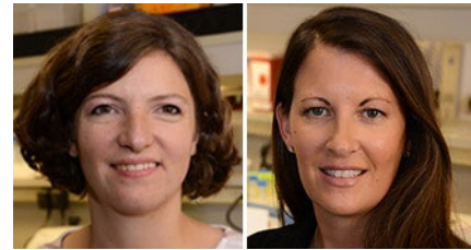
Insight from Lavinia Palamiuc and Brooke M. Emerling

Prostate-specific membrane antigen (PSMA) has become a popular target for developing new diagnosis tools designed to improve stratification of patients for targeted personalized therapeutic regimens (Pillai et al., 2016). PSMA is moderately expressed in several tissues, including healthy prostate tissue; however, it is greatly up-regulated in prostate cancer (Israeli et al., 1994). PSMA has two types of catalytic activities: NAALDase and folate hydrolase,