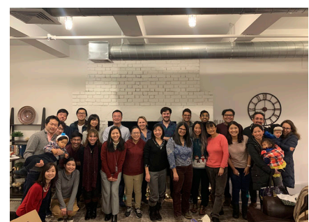
Recent photograph of the Iwasaki laboratory at the holiday party (December 2019).

We have used the mouse model of genital herpes to demonstrate the role of innate sensors, various dendritic cell subsets, lymphocyte recruitment and retention mechanisms, and the role of tissue-resident T cells in protection and enabling antibody access to neural tissues. More importantly, we have leveraged our insights from these basic studies to develop a vaccine strategy called Prime and Pull. This strategy is a two-step immunization protocol in which T cells are generated by a conventional vaccine (Prime), followed by their recruitment to the tissue of interest by application of chemokines or chemokine-inducing agents (Pull). Using animal models, we showed that Prime and Pull can be used to confer