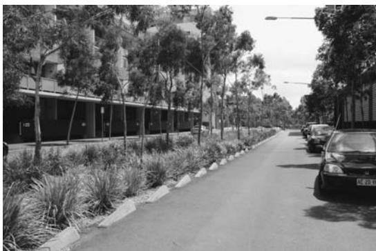
FIGURE 10. Residential street with bioretention and biofiltration median strip in Victoria Park residential development, Sydney, Australia.

result in inadequate regeneration of the grass surface. While the grass surface does become damaged as a result of use, normal use patterns are infrequent and the grass will regenerate naturally. This type of system will also require similar maintenance regimes as a traditional grass lawn, such as mowing, fertilization, and possibly irrigation.