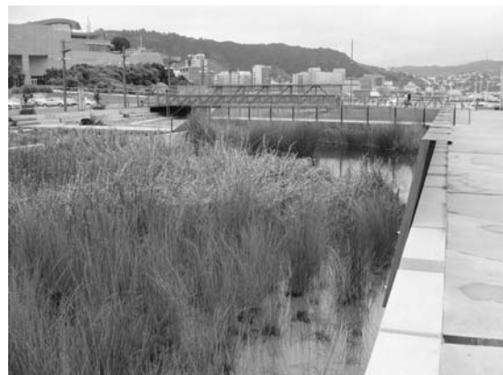
FIGURE 12. Constructed wetlands as an educational and aesthetic feature in Waitangi Park, Wellington, New Zealand.

US EPA (2007b) describes five design variations in wetland design, shallow marsh, extended wetland detention, pond wetland system, pocket wetland, and