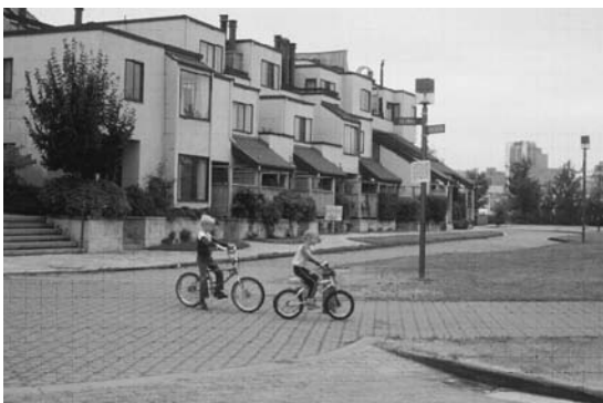
FIGURE 5. Narrow residential street False Creek, Vancouver, Canada.