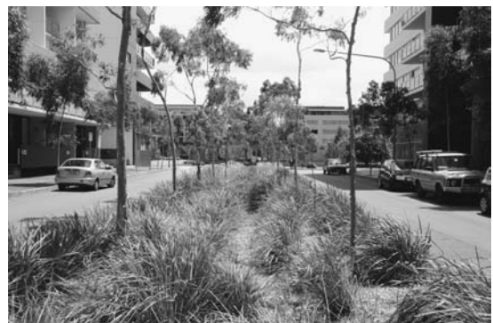
FIGURE 11. Bioretention and biofiltration median strip in Victoria Park residential development, Sydney, Australia.

There are a range of configurations employed, but ideally, the treatment area may consist of a grass buffer strip, a sand edge and base, a ponding area planted with vegetation, and a mulch surface that is depressed