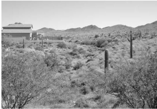
FIGURE 1. Natural drainage corridor at Anthem, north of Phoenix, Arizona.

tional benefits of wildlife habitat, separation and buffering of residential areas, recreational opportunities, and aesthetic appeal. Recent research has shown that developments integrating natural open space are experiencing increased property values.