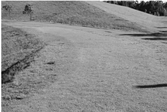
FIGURE 9. Service lane constructed with invisible grass paving Olympic Park, Sydney, Australia.

plastic mat or layer, often provided in rolls, is placed over the prepared base. The plastic mat is 5–8 cm (2–3 inches) thick with connected cell voids that are filled with soil and planting medium. Sod or grass seed is then placed on the surface layer to create a uniform grass surface. This system has about the same permeability as a normal grass lawn and, depending on slope conditions, would retain moisture to allow for better infiltration to subsoil and potentially to groundwater table. The most common problems with this system are related to improper installation and overuse. Because of lack of familiarity, these systems are sometimes installed without a properly prepared base and would then be subject to settling in areas of more frequent use or heavier vehicles. Overuse will