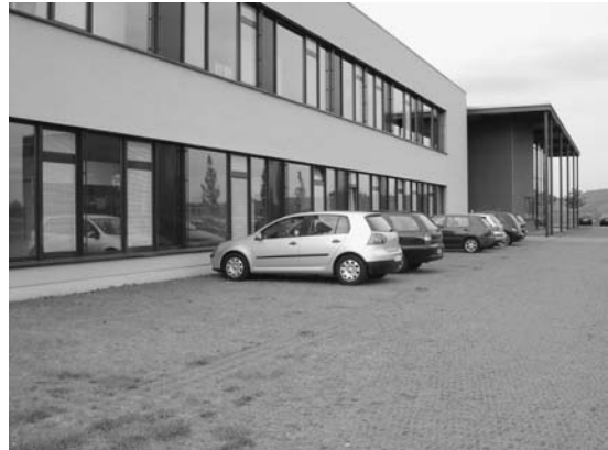
FIGURE 8. Detailed view of paving blocks in Business Park, Castrol-Rauxel, Germany.