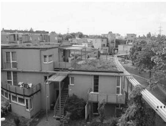
FIGURE 2. Green roofs in Kuppertsbusch ecological housing in Gelsenkirchen, Germany.