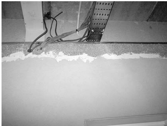
FIGURE 18. Exposed hemcrete surface on interior of building.