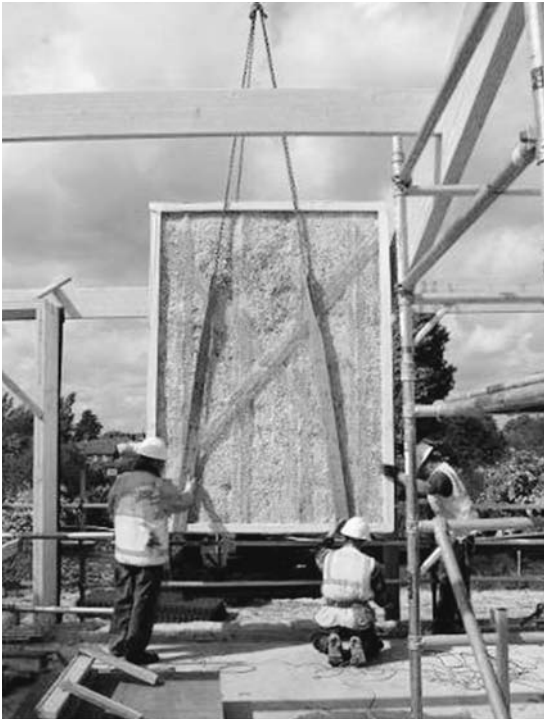
FIGURE 8. Craning ModCell panels into place.

involved in developing the architect's brief for the project. The youth wanted to avoid a typical institutional steel and glass façade. A proposal was made to incorporate ModCell panels in the structure, and was met with an enthusiastic response from the young people involved.