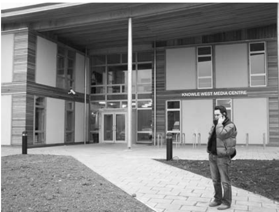
FIGURE 9. Knowle West Media Center.

The primary structural frame for the building is reinforced concrete. Forty-three ModCell panels, Figure 10, provide the exterior cladding for the building. The plaster surface is exposed on the interior of the building, Figure 11. An advantage of using these modular panels is that the building can be expanded in the future if desired. The panels were constructed using bales from farms local to Bristol. Local businesses “sponsored” individual ModCell panels, and were then invited to participate in the fabrication of the panel.