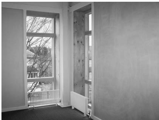
FIGURE 12. The Torfaen Environmental Building.