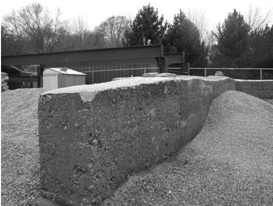
FIGURE 27. Rammed earth wall.