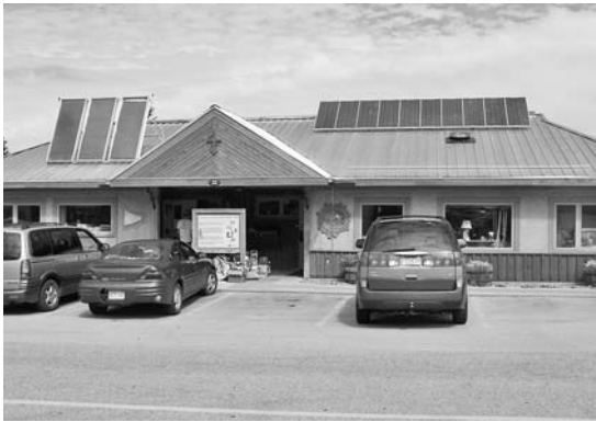
FIGURE 1. Typical straw bale construction.

Mander of Integral Structural Design and architect Craig White of White Design, and is being marketed by Agrifibre. The concept uses prefabricated panels that consist of a timber frame, straw bale in-fill, steel reinforcement, and lime plaster. Prefabricating the panels ensures that panel dimensions can be closely controlled. The panels can be constructed off-site in a dry environment to ensure bales do not get wet.