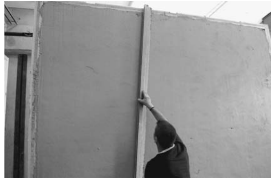
FIGURE 7. Transporting ModCell panels.