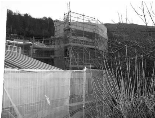
FIGURE 30. Unfired clay bricks being used for partition walls in Lime Technology office.