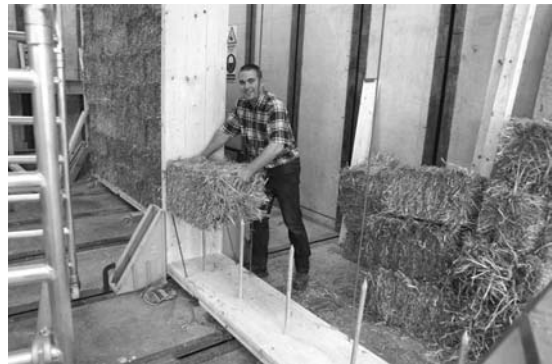
FIGURE 4. Trimming of straw.