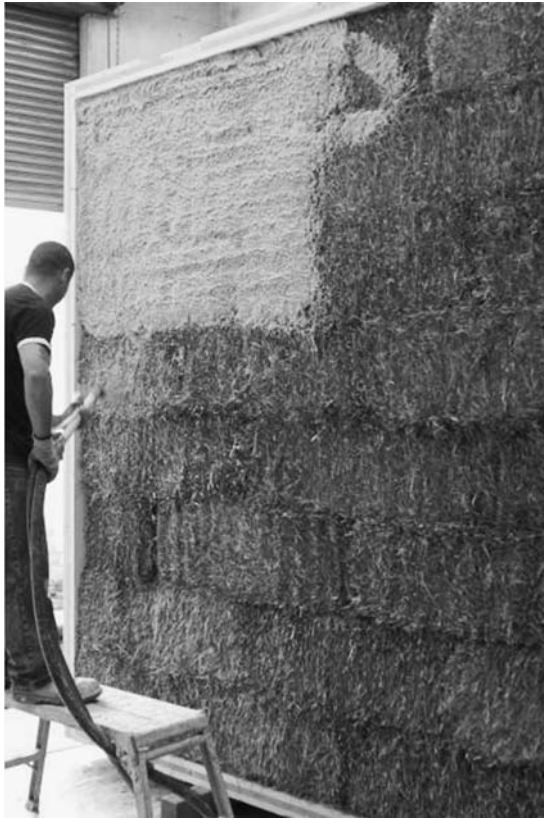
FIGURE 5. Spraying of initial coat of plaster.