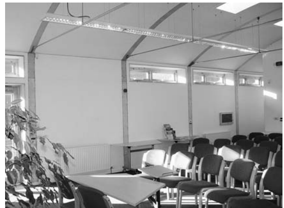
FIGURE 13. Typical wall panel.

Hemcrete, shown in Figure 15, is a composite of a lime binder and the woody core, called hurd, of hemp plants. The hurd is milled to particles of about 10–15 mm in length, and excess fibre and dust is removed. The lime is typically combined with a small amount of cement to reduce the curing time. This lightweight mixture has proven to have excellent