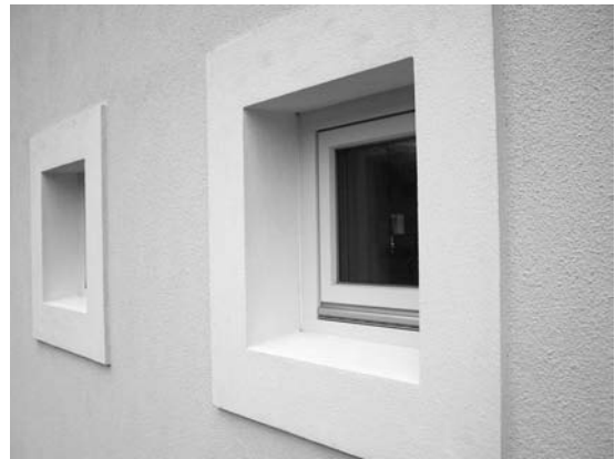
FIGURE 19. Hemcrete wall.

tered for the life of the building. Lime Technology, in fact, markets Tradical as a carbon negative product as compared to a typical building insulation system. Some evidence has been presented in the literature to back this claim, e.g., Arnaud and Samri (2007) who compared the embodied equivalent CO 2 emissions for several insulation products. It should be emphasized that this paper presented only final results and did not describe the analysis used. It is assumed the comparison is based on production values for France and so may not be directly applicable to the North American situation.