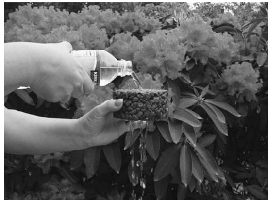
FIGURE 1. Pervious concrete pavements are able to pass flows of water in excess of even the most severe storm rainfall intensities.

How does this relate to pervious concrete? Pervious concrete is concrete. In fact, it is a high quality concrete. Typical pervious mixes have around 6 sacks (564 lb. / CY) of cement per cubic yard, and typically have a w/c ratio of around 0.30, which is normally associated with conventional concrete mixes showing very high strengths, in excess of f_c' = 10,000 psi. But, when we intentionally make holes in any material, it has to be weaker than the same material without holes. And, it is the holes (interconnected pores, or voids) that make pervious concrete pervious. It is the pervious attribute of pervious concrete that makes it desirable. If it were not so sought after, we would likely use conventional concrete.