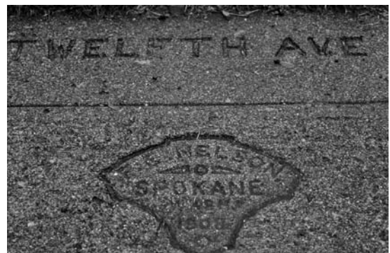
FIGURE 6. “F. E. Nelson Spokane, Wash. 1908”—An example of old concrete pavement with no maintenance in 100 years.

Concrete surfaces are lighter colored, which makes them reflect solar radiation rather than absorb it, and results in mitigating for urban heat island effect. Concrete, both conventional and pervious, uses post-industrial and post-consumer recycled materials such as fly ash, granulated ground blast furnace slag, and recycled concrete aggregates. Pervious concrete may help qualify a project for LEED points in the areas of stormwater management and urban heat island effect, and will result in a lighter surface at night with less applied lighting.