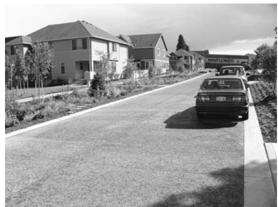
FIGURE 2. City of Seattle's High Point Project—pervious concrete street pavement and pervious concrete sidewalk.

In this region, there are regulations limiting impervious surface lot coverage and also requiring very large stormwater retention/detention facilities. The use of pervious concrete pavements reduces both impervious surface coverage, and the amount of land