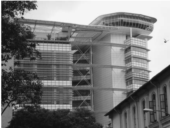
FIGURE 1. The 14-storey National Library Building in Singapore (2000–2005) is regarded as one of the most energy-effective buildings in South East Asia.