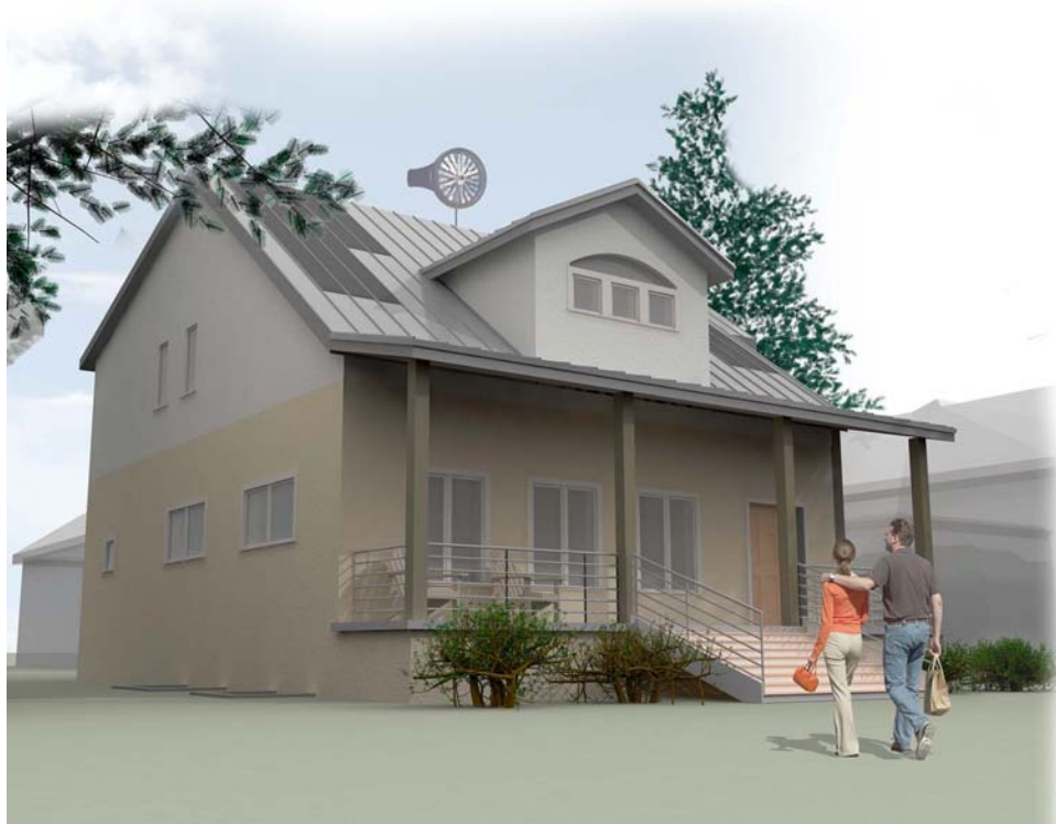
FIGURE 1. Final ZNETH design.