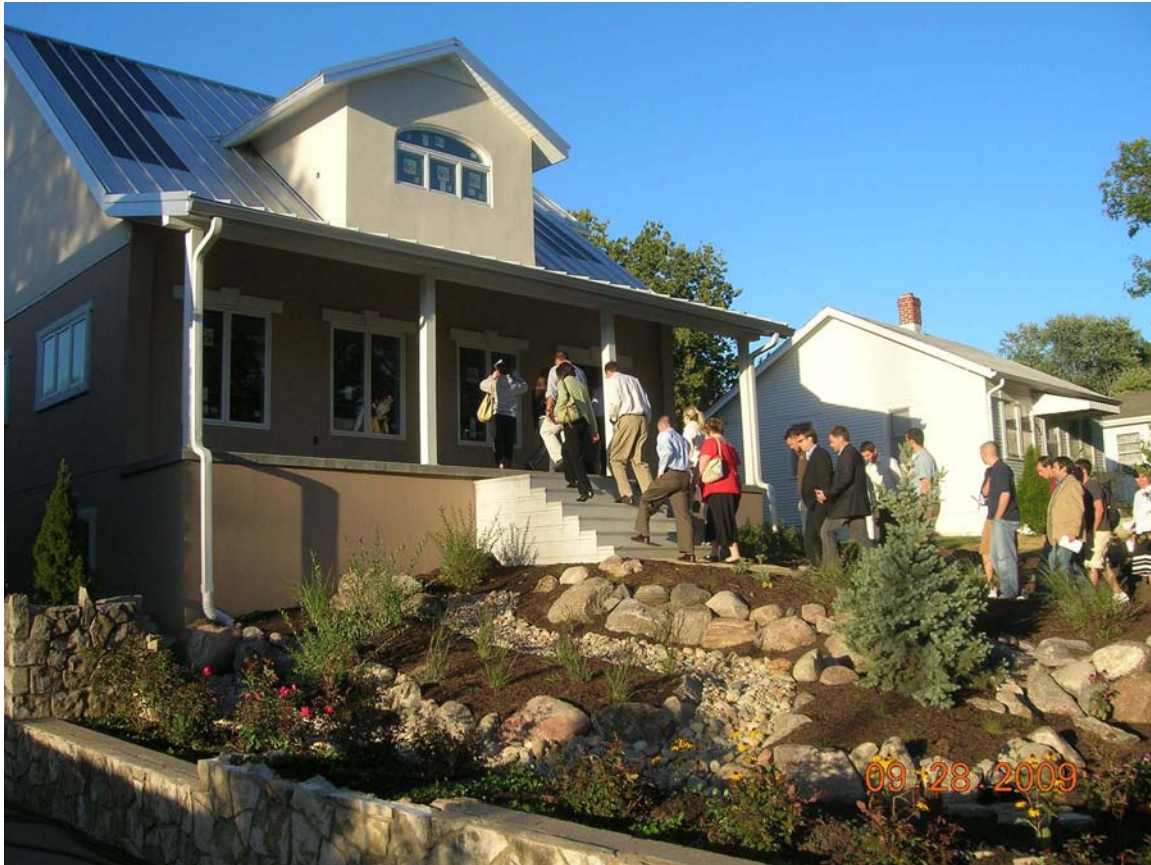
FIGURE 3. Exterior view of final project.