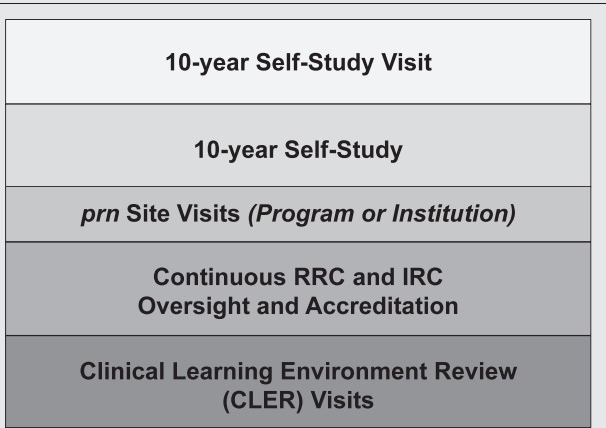
FIGURE 1 THE BUILDING BLOCKS OR COMPONENTS OF THE NEXT ACCREDITATION SYSTEM

Abbreviations: prn , ( pro re nata ) according to circumstances; RRC, Residency Review Committee; IRC, Institutional Review Committee.