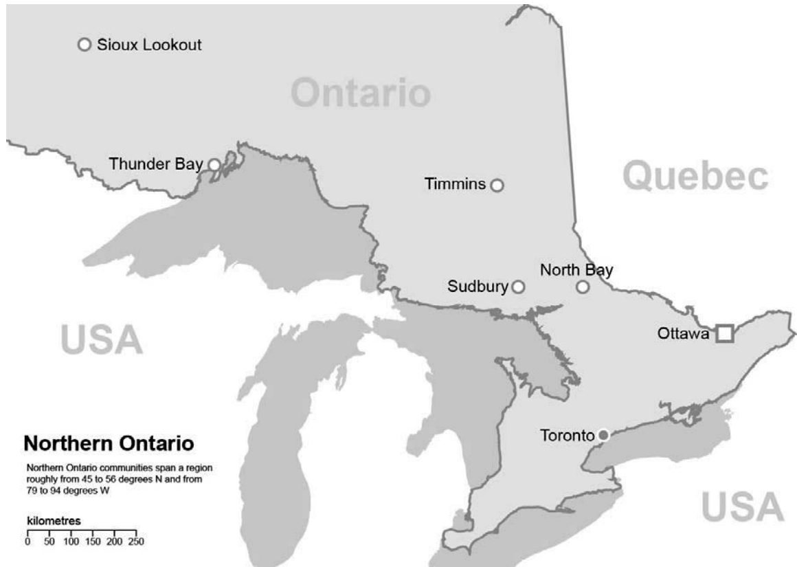
FIGURE 1 Location of the Training Sites Involved in the Study

level codes from clusters and patterns in this network analysis.