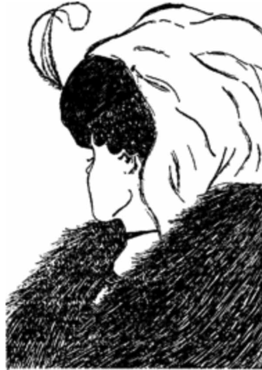
Figure 1 | What do you see? (Figure 3.1 in Gerald M. Weinberg ‘An Introduction to General Systems Thinking’, Dorset House, New York; Silver Anniversary Edition, 2001. Loc. 1215. Kindle edition).

When we wish to see the ‘wholeness’ of a phenomenon in our mind’s eye, conceived as an object of our perception or experience, analyzing it into a set of interrelated parts destroys what we seek. By separating and then interrelating the parts as a system, we externalize as a solid-like object the