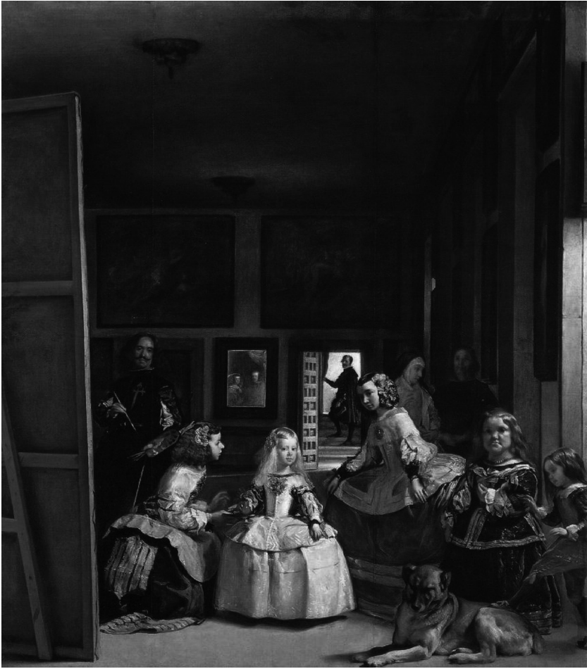
Fig. 4 Diego Velázquez's Las Meninas (1656)

particularly clear portraits of children as social actors in the humanities and social sciences, the most recent archaeological shift in childhood is centuries old. Its origins are evident in one of the best-known works dealing with the modern problem of representation—Diego Velázquez's Las Meninas (1656) (Figure 4). The object of gaze is “you,” the viewer of the object, but this tension becomes possible only by granting Las Meninas (the girl and the painting) the privilege of a knowing subject. The deployment of childhood for such purposes is not incidental. As Figure 2