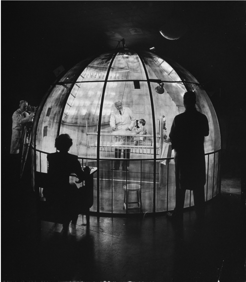
Fig. 3 Arnold Gesell's Observation Dome, 1947

framework. It remains the organizing principle of the “milestones” on which the American Academy of Pediatrics bases its advice even now. 7