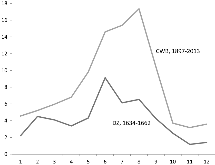
Fig. 2 Monthly Raining Days in Tainan

NOTE The series DZ, 1634–1662, excludes months with incomplete weather records. Years 1629–1633 and 1637–1640 are excluded because the diaries in those years hardly mentioned weather conditions.