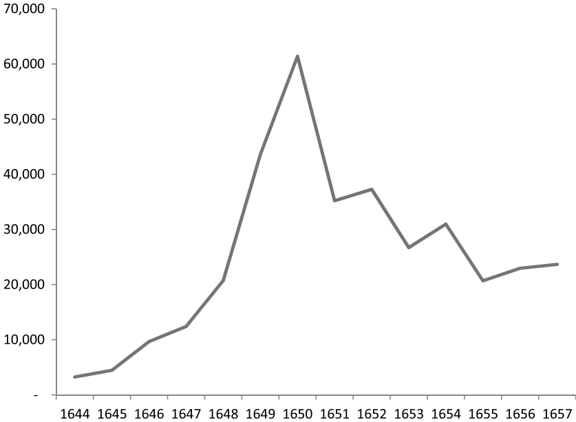
Fig. 1 Sales of Village-Leasehold Rights (in Reals)

NOTES (1) The revenue from Lamey Island, which became almost uninhabited after the Dutch massacred around 300 Lameyans in 1636, moving survivors to Taiwan and Batavia, is not included because of the different nature of its leasehold (see Yung-Ho Ts'ao and Leonard Blussé, "Disappearance of Lameyans: To Recover a Lost Page in Taiwan History," in Research on Taiwan History in the Early Period: The Sequel [Taipei, 2000], 185–237). Unlike leaseholders of other villages, where mainly trade in deer products was at stake, the leaseholder of Lamey Island reclaimed land. (2) Fishing rights are excluded except for those during the years 1652 and 1653, because no detailed records are available for these two years to distinguish fishing rights from other trading rights.