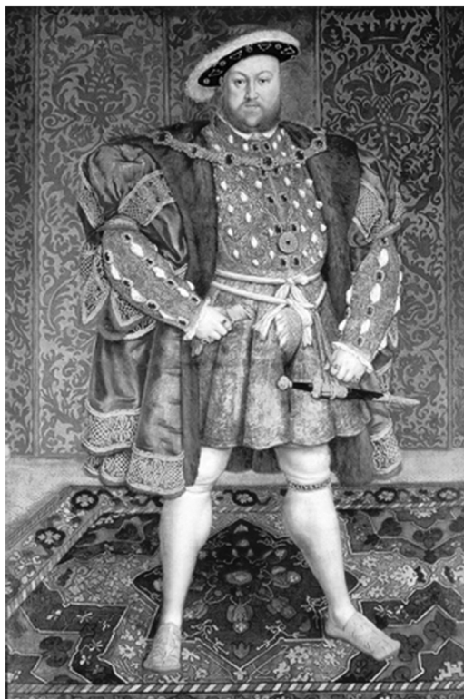
Fig. 1 Portrait of Henry after Holbein, c 1530 (Wikimedia Commons)

The understanding at this time that men as well as women could suffer from problems of infertility was tentative and unlikely to have been countenanced by a Tudor monarch. Space does not allow a complete survey of the late medieval/early modern medical literature that included a mention of male infertility. Suffice it to say that it was usually, but not always, confined to an inability to perform. Yet, notwithstanding Rider's observation that scholars have tended to neglect males' reproductive disorders in the Middle Ages compared with females', early references to male infertility are available. Witness, for example, the late fourteenth-century treatise by John of Mirfield, St. Bartholomew's Hospital London, which warned, "When sterility happens between married people, the males are accused by many people of not having suitable seed." Similarly, Evans pointed out that the historical focus on female