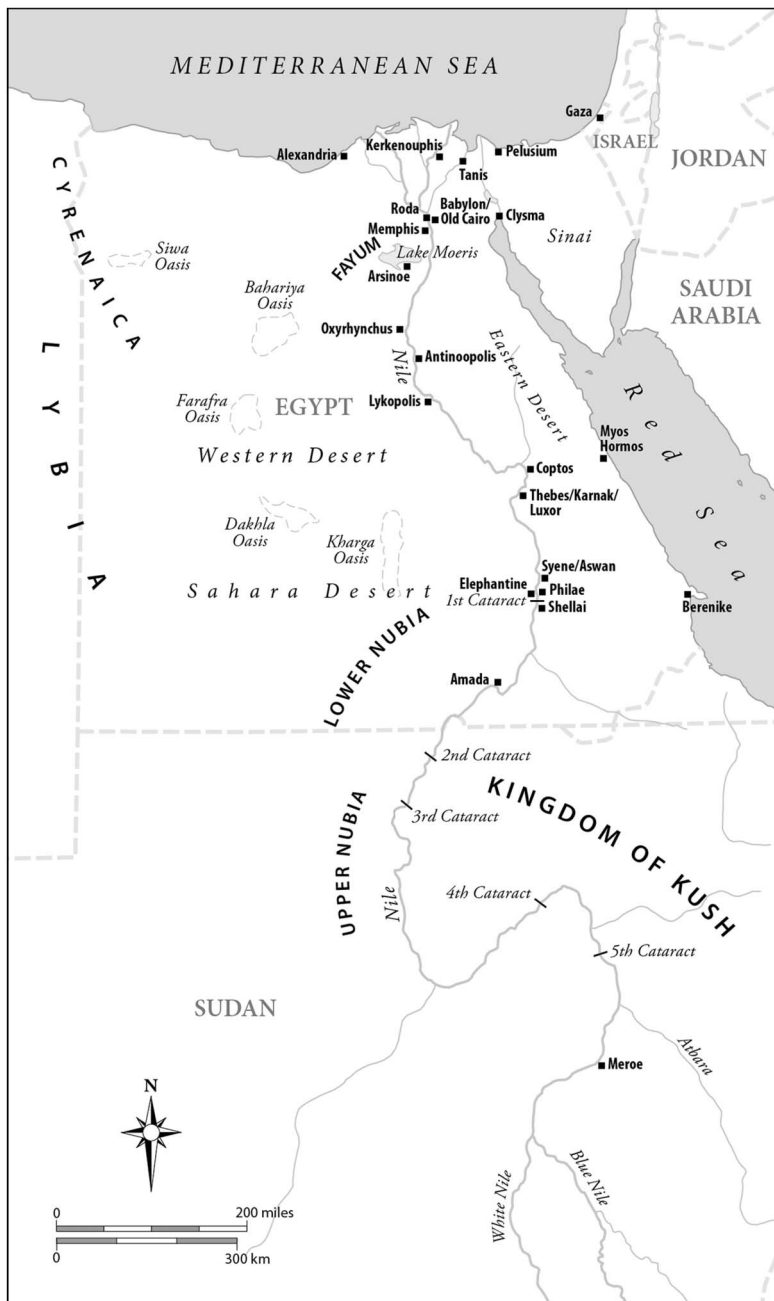
Fig. 1 Egypt and Northeast Africa in Antiquity, with Modern Geographical Boundaries