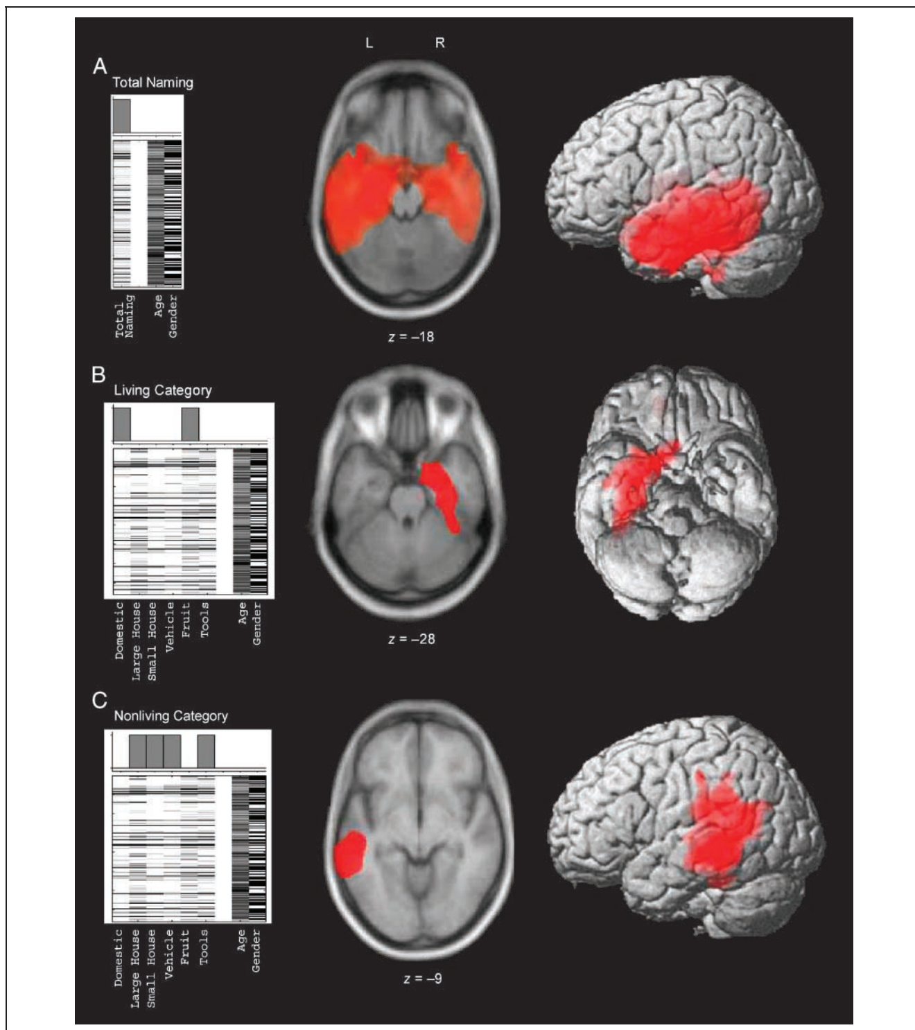
Figure 1. Brain areas that positively correlate with: (A) total naming score; (B) living scores; (C) nonliving scores. Design matrices and contrasts are displayed for each analysis. The threshold for display is p < .001 , uncorrected. Maps of significant correlation are superimposed on axial sections of the unsmoothed template image and on the 3-D rendering of the MNI standard brain. The coordinates of the sections correspond to the peak of each significant effect (see Table 3).