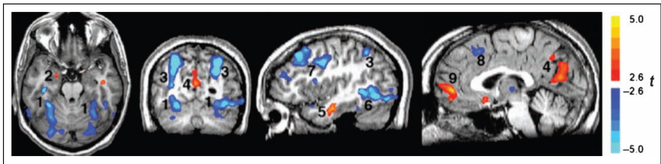
Figure 4. Areas with a differential response to human and robotic face expressions. The threshold for colored regions is p < .025 , two-tailed. The color scale shows values of t(df = 11) . Axial ( z = -14 ), coronal ( y = -67 ), left sagittal ( x = -40 ), and midline sagittal ( x = -2 ) sections are shown. Areas showing differential responses: 1 = fusiform gyrus; 2 = amygdala; 3 = intraparietal sulcus; 4 = cuneus; 5 = anterior temporal cortex; 6 = middle and inferior temporal gyrus; 7 = premotor area; 8 = supplementary motor area; 9 = MPFC.

of stimuli rather than their animacy. Robotic stimuli cannot be construed as abstract or degraded depictions of animate entities. They mimic facial expressions but are recognizably and definitively inanimate. Nonetheless, our results show that robots that are designed to produce facial expressions very effectively engage the occipital, fusiform, and superior temporal sulcal cortices for face perception.