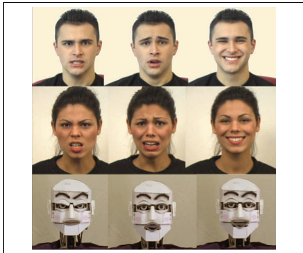
Figure 1. Example of the stimuli used during the fMRI experiment (here as still pictures). Still images from the videos for three expressions (anger, fear, and happiness) are shown here. The full set of video stimuli used all six primary expressions (anger, disgust, fear, surprise, happiness, and sadness).

Videos of an actor, an actress, and a robot performing the six primary expressions (fear, surprise, disgust, angry, sadness, and happiness; see Figure 1) were used as stimuli while the participants were passively viewing the expressions. Videos with the human faces were produced using a Canon XL1s 3CCD digital video camera and were edited using iMovie (Apple Computer, California). The videos of