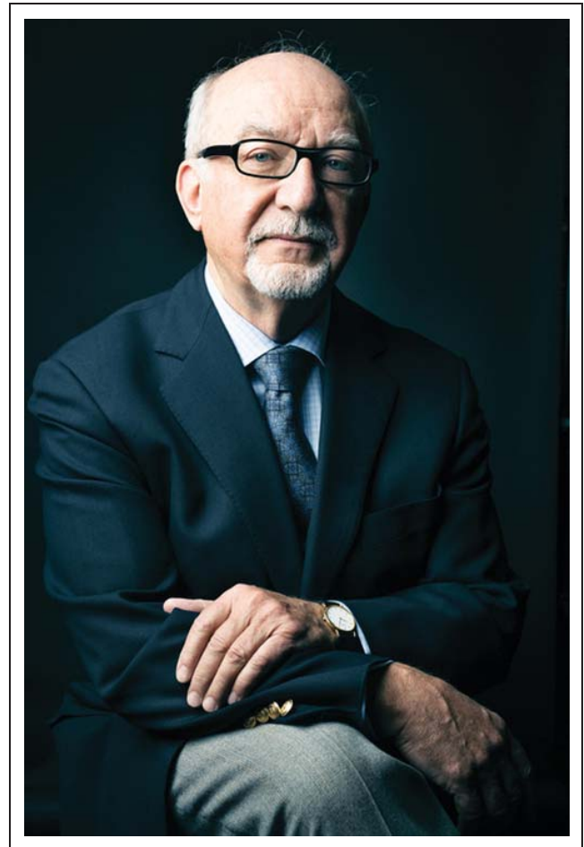
Figure 1. 2013