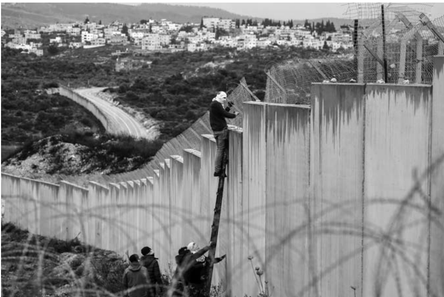
A masked Palestinian in Bil'in, a village near Ramallah, cuts through the barbed wire lining the separation wall with Israel. In the background is Mod'in Ilit, one of the largest Israeli settlements in the West Bank. (7 February, Abbas Momani/AFP via Getty Images)