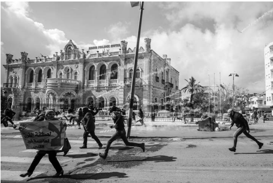
Palestinians protesting the Trump administration's Middle East "peace plan" run from Israeli projectiles in front of Bethlehem's Jacir Palace Hotel. (29 January, Musa al Shaer/AFP via Getty Images)