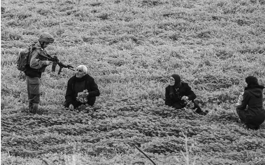
An Israeli soldier trains his gun on a small group of Palestinian farmers as he checks their identification documents in a field near al-Hamra checkpoint in the Jordan Valley. (28 January,)