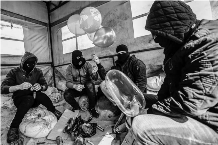
Masked Palestinians inflate balloons and assemble incendiary devices in al-Bureij refugee camp close to the Gaza-Israel perimeter fence. The use of such devices surged after the Trump administration's 28 January announcement of its Middle East "peace plan." (10 February)