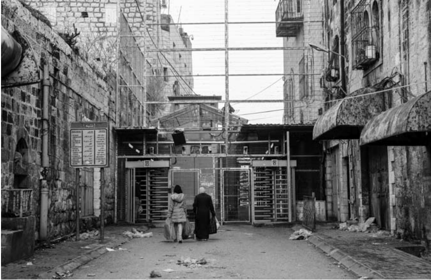
Two Palestinian women in the West Bank city of Hebron approach an Israeli checkpoint to cross into Shuhada Street, once Hebron's main marketplace and thoroughfare. Israeli forces have all but closed off Palestinian access to Shuhada Street since 1994. (13 January,)