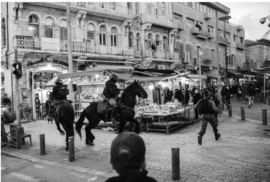
Mounted Israeli security forces patrol al-Aqsa Mosque compound in East Jerusalem following the widespread Palestinian protests against the so-called deal of the century, the Trump administration's Middle East "peace plan." Israeli forces temporarily closed all gates to the compound after arresting two Palestinian teenagers for alleged possession of a knife. (29 January, Mostafa Alkharouf/Anadolu Agency via Getty Images)