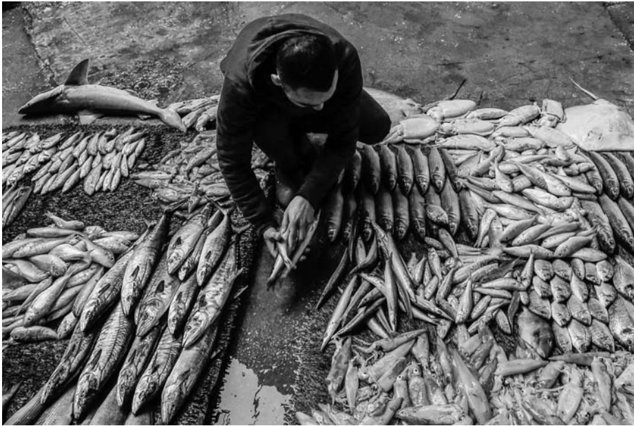
A Palestinian fisherman displays his catch at a market in Gaza City. (13 January, Mohammed Abed/AFP via Getty Images)