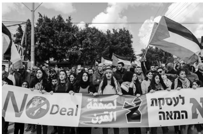
Palestinian protesters in the northern Israeli town of Baqa al-Gharbiyya demonstrate against U.S. president Donald Trump's so-called deal of the century. The Trump administration's "peace plan" has been unanimously rejected by Palestinians (see Palestine Unbound in this issue). (1 February)