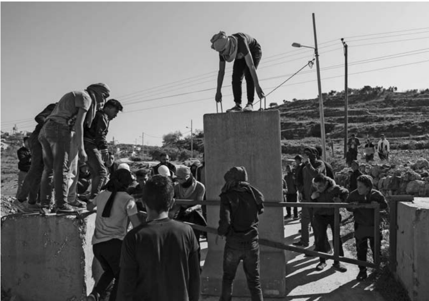
Palestinians from Dayr Nizam struggle to remove cement blocks placed by the Israeli military at the village entrance. The Israeli authorities erected the barriers after widespread Palestinian protests against the Trump administration's proposed Middle East "peace plan." Although the villagers were eventually able to remove the blocks, Israeli soldiers replaced them two days later. (15 February, Abbas Momani/AFP via Getty Images)