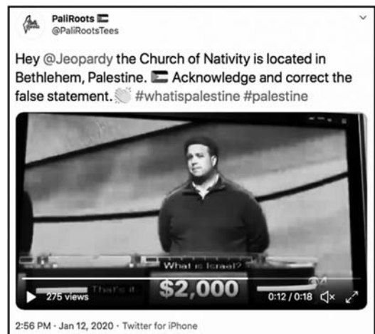
The @PalRootsTees account uses trending hashtags to show support for Katy Needle. (12 January, Twitter)