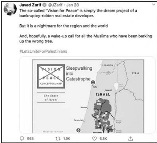
Iranian foreign affairs minister Javad Zarif presents a more truthfully labeled version of the White House's "Vision of Peace" conceptual map. (28 January, Twitter)

The plan solicited mixed but predictable reactions internationally: condemnation from the United Nations, the Catholic Church, the British Labour Party, Turkey, Iran, and of course Palestine, among others; and praise from Qatar, Saudi Arabia, the Conservative Party in the UK, and France.