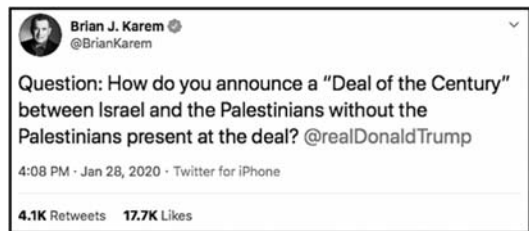
U.S. journalist Brian Karem tweets at Donald Trump. (28 January, Twitter)