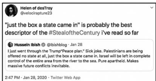
A Twitter user deploys the trending #StealOfTheCentury hashtag. (28 January, Twitter)

Protest on social media raged in parallel, with Twitter users employing the StepFeed-endorsed hashtag #PeaceSham to denounce the Trump administration's scheme. The hashtags #StealOfTheCentury, #ApartheidPlan, and #SlapOfTheCentury—a reference to PA president Mahmoud Abbas who, in a play on words, described the deal ( safqa , in Arabic) as a slap ( safa )—were also deployed to mobilize international protest.