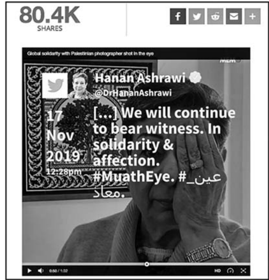
Hanan Ashrawi participates in solidarity messaging on Twitter on 17 November.