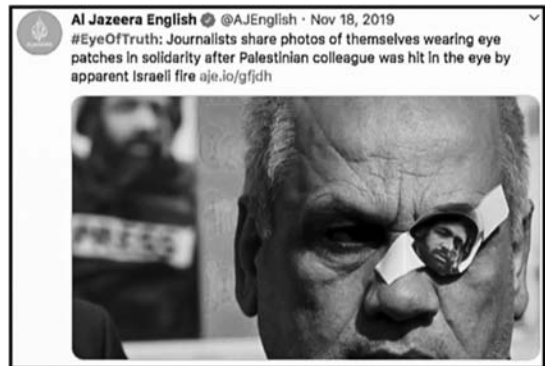
Al Jazeera shares of a photo of a journalist wearing an eye patch in solidarity with Israeli-blinded photojournalist Muath Amarneh. The eye patch is also a photo of Amarneh. (18 November, Twitter)

News anchors from Palestine TV's studios in Jerusalem to Kuala Lumpur's TV AlHijrah bandaged their left eyes in symbolic solidarity with Amarneh. On 20 November, three days after the public