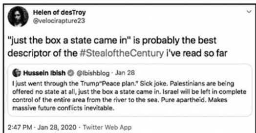
A Twitter user deploys the trending #StealOfTheCentury hashtag. (28 January, Twitter)

Protest on social media raged in parallel, with Twitter users employing the StepFeed-endorsed hashtag #PeaceSham to denounce the Trump administration’s scheme. The hashtags #StealOfTheCentury, #ApartheidPlan, and #SlapOfTheCentury—a reference to PA president Mahmoud Abbas who, in a play on words, described the deal ( safqa , in Arabic) as a slap ( safa )—were also deployed to mobilize international protest.