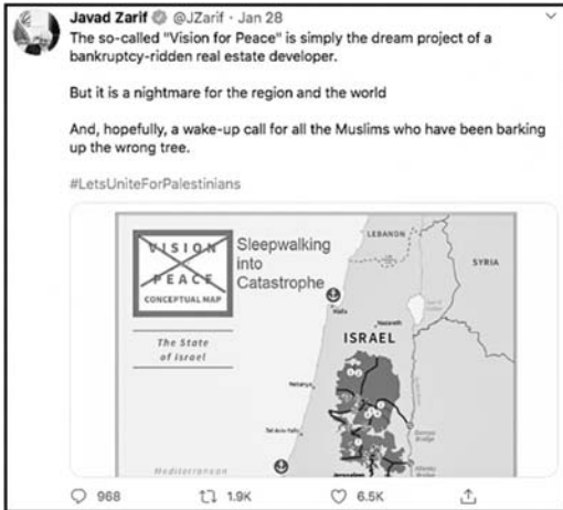
Iranian foreign affairs minister Javad Zarif presents a more truthfully labeled version of the White House’s “Vision of Peace” conceptual map. (28 January, Twitter)

The plan solicited mixed but predictable reactions internationally: condemnation from the United Nations, the Catholic Church, the British Labour Party, Turkey, Iran, and of course Palestine, among others; and praise from Qatar, Saudi Arabia, the Conservative Party in the UK, and France.