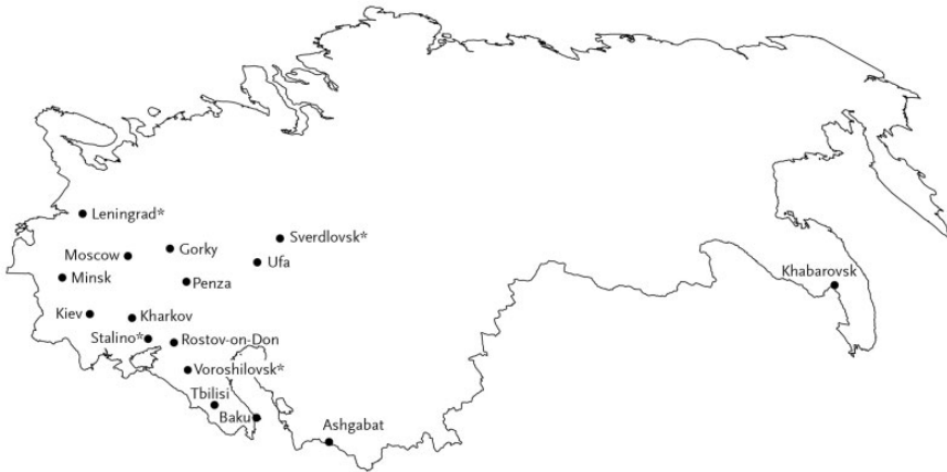
Fig. 4. Map of phage research in USSR, c. 1940, based on conference contributions and journal articles. * Names are given as of 1940: Leningrad is now St. Petersburg, Sverdlovsk is Ekaterinburg, Stalino is Donetsk, and Voroshilovsk is Stavropol’.