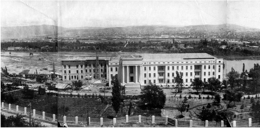
Fig. 2. Construction of the Tbilisi Institute of Microbiology, Epidemiology, and Bacteriophage on the bank of the Kura river in Saburtalo, Tbilisi, c. 1939.