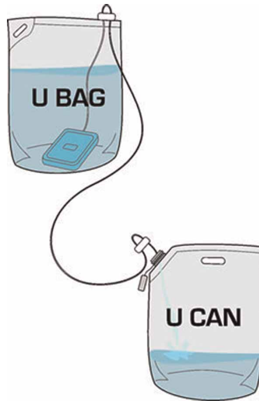
Figure 1 | Diagram describing the use of the Nerox™ filter.

The Nerox™ filter (A-Aqua, Oppegard, Norway) is a gravity water filter system (Figure 1) that employs a 0.28 µm