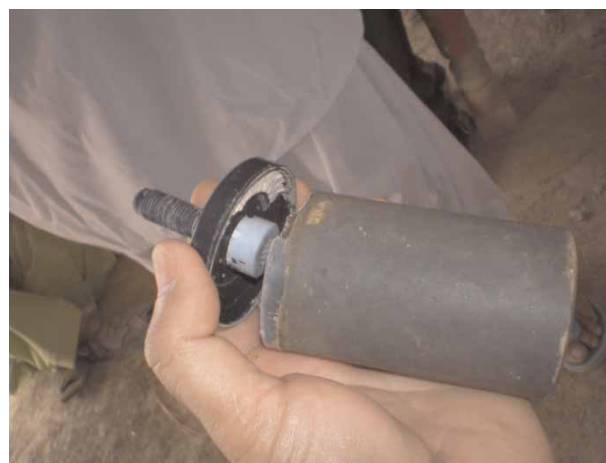
Figure 3 | Broken ceramic filter.

maximum turbidity concentration found for irrigation water of over 900 NTU. TTC concentrations in source water ranged from 138 to 600 CFU/100 ml. Seepage water from irrigation canals retrieved by hand pump was of the best