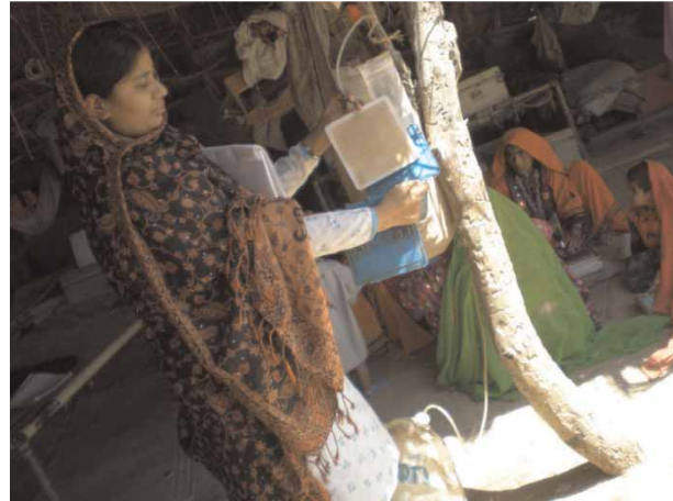
Figure 4 | Blocked Nerox™ membrane filter.

The majority of the study participants appreciated the visual improvement in water quality and an improved taste, which was associated with a perceived positive health impact. However, many problems were reported too. The long time needed to filter water, and the small quantities provided per day were reported by almost all study participants as problematic. Over 90% of the study participants cleaned the filters, either daily or every second day, although the manufacturer states that every 3 to 7 days should be sufficient. The frequent cleaning of the