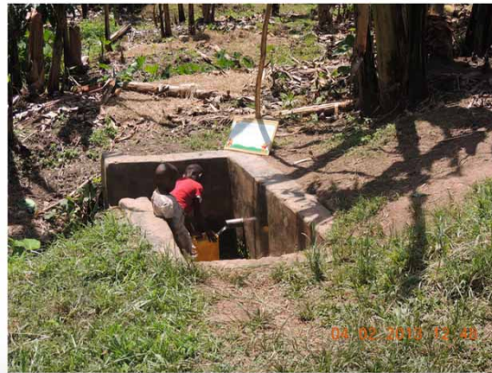
Figure 2 | Sample query results (English language version) for photo-assisted identification of household water source using Computer Assisted Survey Information Collection (CASIC) Builder™ software.

Water source number: 2 Cell: Nyamikanja 2 Village: Kyaritimbo Type: Spring Name: Kyaritimbo Select