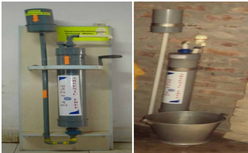
Figure 3 | Wall mounted household ATUs, devised by Council of Scientific & Industrial Research, Central Salt & Marine Chemical Research laboratory were provided in Sangrampur, Merudandi and Basirhat areas in West Bengal State during 2009. Source: P. S. Anand (2013). Approaches to arsenic removal from drinking water sources and learning from field experiences. Workshop on Arsenic Removal Technologies, organized by Ministry of Environment & Forest, Government of India, Kolkata.