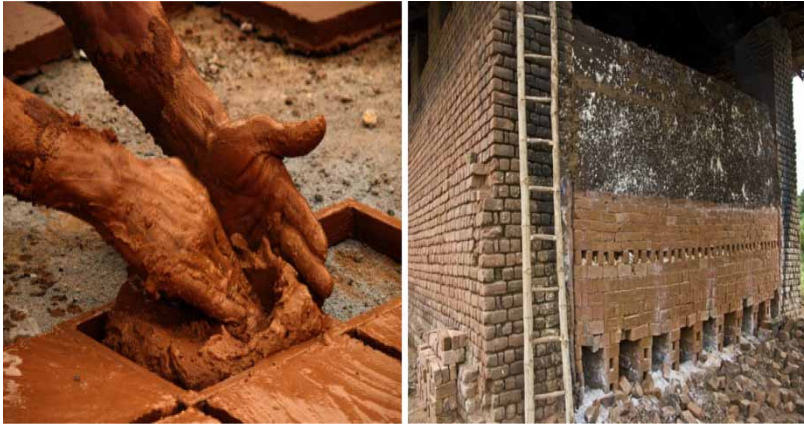
Figure 5 | Towards safe disposal of arsenic containing sludge: use of arsenic containing sludge in making bricks.

arsenic affected rural habitations have been provided with safe drinking water since the year 2009. However, there is no doubt that the policy initiatives at Government of India level, which really began in 2009, has created awareness about analysis of arsenic in drinking water sources among state officials. The different initiatives have also strengthened arsenic testing in drinking water through arsenators and in laboratories. The increased testing of arsenic in drinking water has also brought to the fore more arsenic affected habitations to deal with. IEC activities in rural areas should also focus on awareness about availability of some of the simple, user-friendly and affordable arsenic treatment systems so that they can procure these systems themselves individually or through community contribution as an interim measure, until a piped water supply is provided at household level. Technologies such as SORAS offer remediation even for the poorest of the poor for treatment of arsenic in the medium range (100–150 \mu\text{g/L} of arsenic contamination) without use of electricity at virtually no cost.