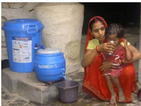
Figure 4 | Use of Kanchan arsenic filter in rural areas at household level.