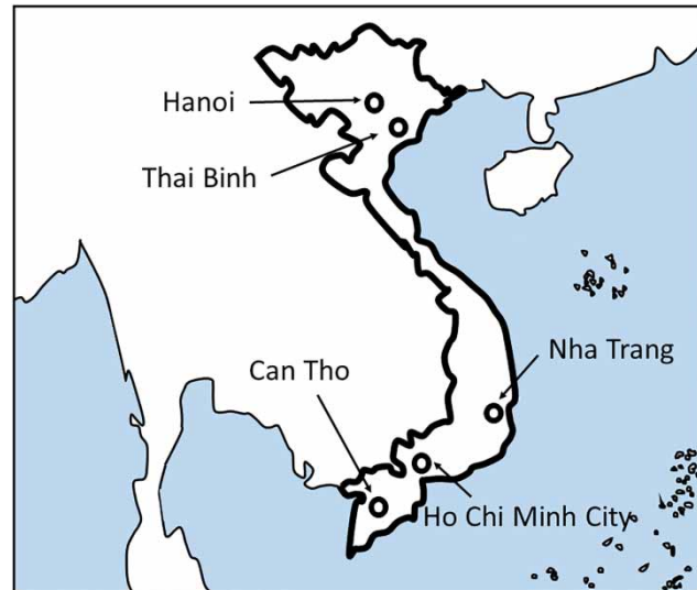
Figure 1 | Locations where edible ice samples were harvested in this study. Samples were obtained from restaurants in Hanoi, Thai Binh, Nha Trang, Ho Chi Minh City, and Can Tho, Vietnam.

Edible ice samples were collected from 62 restaurants in Vietnam (15 in Hanoi, 13 in Can Tho, 13 in Nha Trang, 12 in Thai Binh, and nine in Ho Chi Minh City; Figure 1) between March 2014 and March 2016. For comparison,