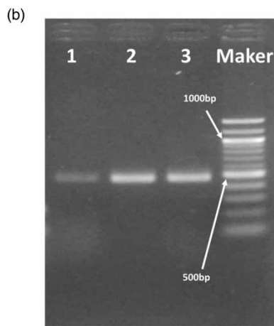
Figure 3 | Acquisition of the bla CTX-M-9 gene by intestinal Escherichia coli after consumption of edible ice contaminated with antibiotic resistant bacteria (ARB). (a) Total number of BG-CTX strains in mouse feces. (b) Confirmation of the presence of the bla CTX-M-9 gene in E. coli harvested from mouse feces by PCR, followed by agarose gel electrophoresis analysis. Lane 1, edible ice; lane 2, Pseudomonas spp. isolates from edible ice; lane 3, E. coli isolated from feces.

(time 0), approximately 8.6 \times 10^3 CFU/mL and 9.0 \times 10^4 CFU/mL BG-CTX were detected at 4 and 7 days post-administration, respectively (Figure 3(a)). BG-CTX strains of E. coli , Enterobacter cloacae , and S. maltophilia were then isolated from mice feces and characterized. Of these, only E. coli strains were found to harbor the bla CTX-M-9 gene via PCR analysis (Figure 3(b)).