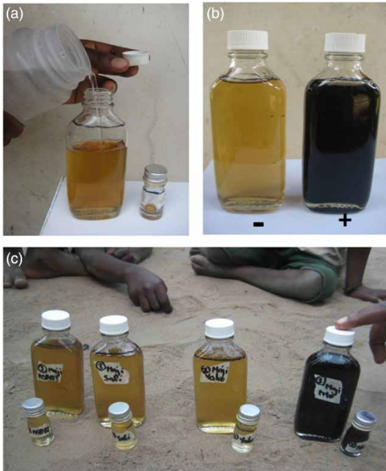
Figure 1 | H 2 S water quality testing: (a) water sample being added to 100 mL and 5 mL bottles containing H 2 S media; (b) after 24 h at ambient temperatures (22–30 °C) positive samples turned black (bottle on the right) while negative samples had no colour change and remained straw coloured (bottle on the left); (c) H 2 S demonstration in the field with a community member correctly identifying the positive sample (far right).

(Table S4). This was determined as low risk. When the 100 mL test was positive and the 5 mL test negative then there is an estimated range of greater than 20 bacteria but less than 100