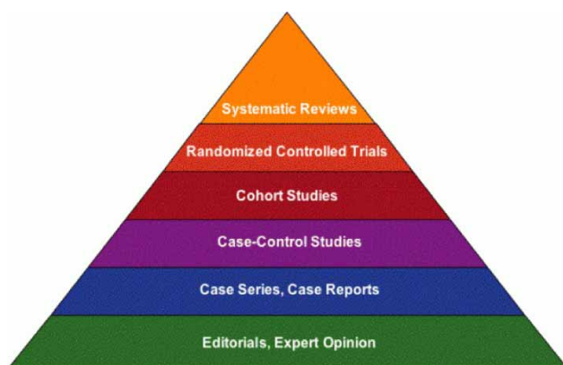
Figure 1 | Level of evidence hierarchy.

The results of the search algorithm were first screened by article title, secondly by article abstract, and thirdly by article full text for relevancy to the RQs and meeting of selection criteria. For selected articles, information was abstracted and entered into an Excel spreadsheet, with each row representing an individual selected article, and each column denoting key elements abstracted from the selected articles. Topics included general and specific information about the article introduction, methods, results, and conclusions. For each article, the level of evidence was assessed using the level of evidence hierarchy (Figure 1), which was used for limiting secondary reviews (i.e. inclusion criteria for additional relevant articles identified through the review of references of abstracted articles) as well as to assess the findings, identify limitations, and add credence to conclusions. Evidence of causal processes was