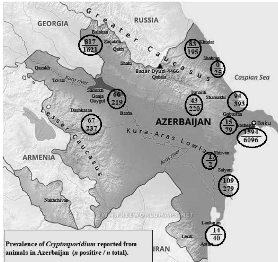
Figure 1 | Map of Azerbaijan borders.

Fecal samples were collected from wild terrestrial and marine animals, birds, and domestic animals from different natural areas and the urban or rural regions of Azerbaijan in the different seasons of the year.