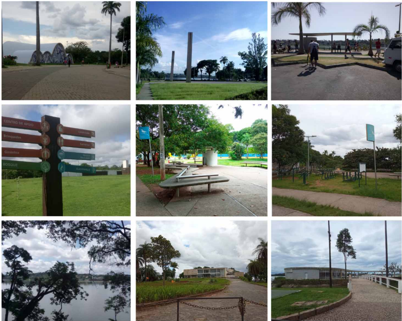
Figure 1 | PLS touristic and leisure spots (from left to right): 1. São Francisco de Assis Church; 2. Nova Pampulha Square; 3. Bem-te-vi viewpoint; 4. Ecological Park; 5. SabiaViewpoint; 6. Garça Viewpoint; 7. Bigua viewpoint; 8. Pampulha Art Museum; 9. Casa do Baile Museum.

Unlike the city centre, the PLS does not have many alternative toilets nearby, such as in malls, stores, or shopping centres. This fact makes the PLS an ideal place to evaluate the experiences and attitudes that people have in situations where there are no solutions around or when they do not consider the current solutions adequate.