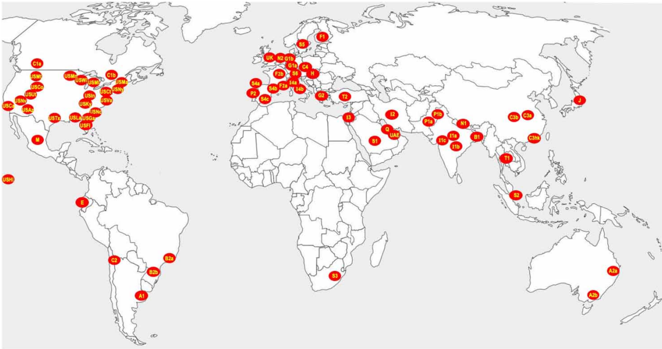
Figure 1 | Geographic distribution of available publications on WBS (A1: Iglesias et al. 2021; A2: Ahmed et al. 2020; Black et al. 2021; B1: Ahmed et al. 2021a; B2a: Fongaro et al. 2021; B2b: Prado et al. 2021; B2c: Acosta et al. 2021; C1a: Acosta et al. 2021a, 2021b; C1b: D'Aoust et al. 2021a, 2021b; C2: Ampuero et al. 2020; C3a: Zhang et al. 2020a; C3b: Zhao et al. 2021; C3hk: Xu et al. 2021; C4: Mlejnkova et al. 2020; E: Guerrero-Latorre et al. 2020; F1: Hokajarvi et al. 2021; F2a: Trottier et al. 2020; F2b: Wurtzer et al. 2020; G1a: Agrawal et al. 2021; G1b: Westhaus et al. 2021; G2: Pechlivanis et al. 2021; H: Roka et al. 2021; I1a: Arora et al. 2020; I1b: Hemalatha et al. 2021; I1c: Kumar et al. 2021; I2: Nasser et al. 2021; I3: Bar Or et al. 2020, 2021; I4a: Rimoldi et al. 2020; I4b: LaRosa et al. 2020, 2021; J: Haramoto et al. 2020; Hata et al. 2021; Kitamura et al. 2021; Miura et al. 2021; M: Carillo-Reyes et al. 2021; N1: Napit et al. 2021; N2: Medema et al. 2020a; P1a: Sharif et al. 2021; P1b: Yaqub et al. 2021; P2: Tomasino et al. 2021; Q: Saththasivam et al. 2021; S1: Hong et al. 2021; S2: Wong et al. 2021; S3: Johnson et al. 2021; Street et al. 2020; S4a: Balboa et al. 2021; S4b: Chavarria-Miró et al. 2021; Fernandez-Cassi et al. 2021; Rusinol et al. 2021; S4c: Randazzo et al. 2020a, 2020b; S5: Saguti et al. 2021; S6: Goncalves Cabecinhas et al. 2021; T1: Wannigama et al. 2021; T2: Alpaslan Kocamemi et al. 2020; Kocamemia et al. 2020; UAE: Albastaki et al. 2021; Hamouda et al. 2021; UK: Hillary et al. 2021; USAz: Betancourt et al. 2021; USCa: Graham et al. 2021; USCo: Reeves et al. 2021; USCT: Peccia et al. 2020; USFI: Gering et al. 2021; USGa: Liu et al. 2020; USHi: Li et al. 2021; USIn: Bivins et al. 2021; USKy: Fuqua et al. 2021; USLa: Sherchan et al. 2020; USMa: Wu et al. 2020; USMi: Miyani et al. 2020; USMn: Melvin et al. 2021; USMt: Nemudryi et al. 2020; USNv: Gerrity et al. 2021; USNy: Green et al. 2020; Wilder et al. 2021; USNc: Gibas et al. 2021; USTx: Stadler et al. 2020; USUt: Weidhaas et al. 2021; USVa: Curtis et al. 2020; Gonzalez et al. 2020; USWi: Feng et al. 2021).

workers and others to environmental exposures via the water route (Lodder & de Rosa Huisman 2020). Jones et al. (2020) performed a detailed review of available evidence about those possibilities. They reported the abundance of detected gene copies 3 (gc) signaling the presence of SARS-CoV-2 in urine ( \sim 10^2 – 10^5 gc/mL) and feces ( \sim 10^2 – 10^7 gc/mL), which are both lower than the virus count in nasopharyngeal fluids ( \sim 10^5 – 10^{11} gc/mL). Domestic sewage will contain all three of these excretions because it is not limited to toilet drainage, but also includes bath and laundry wastewaters. Jones et al. (2020) concluded that other than direct person-to-person contact, sewage is very unlikely to transmit COVID-19 in the environment, although Kang et al. (2020) provided probable evidence for sewage aerosol transmission in an apartment building. Giacobbo et al. (2021) agreed that extensive aquatic environmental transmission of COVID-19 was not likely and noted that as of the submission date of their review (February 1, 2021), there had been no case of COVID-19 attributed to SARS-CoV-2-contaminated water or wastewater among the more than 100 million cases worldwide (262 million cases as of November 30, 2021). Ahmed et al. (2021b) reviewed the critical distinction between possible and probable wastewater transmission of COVID-19. Buonerba et al. (2021), in a wide-ranging review about the hazards associated