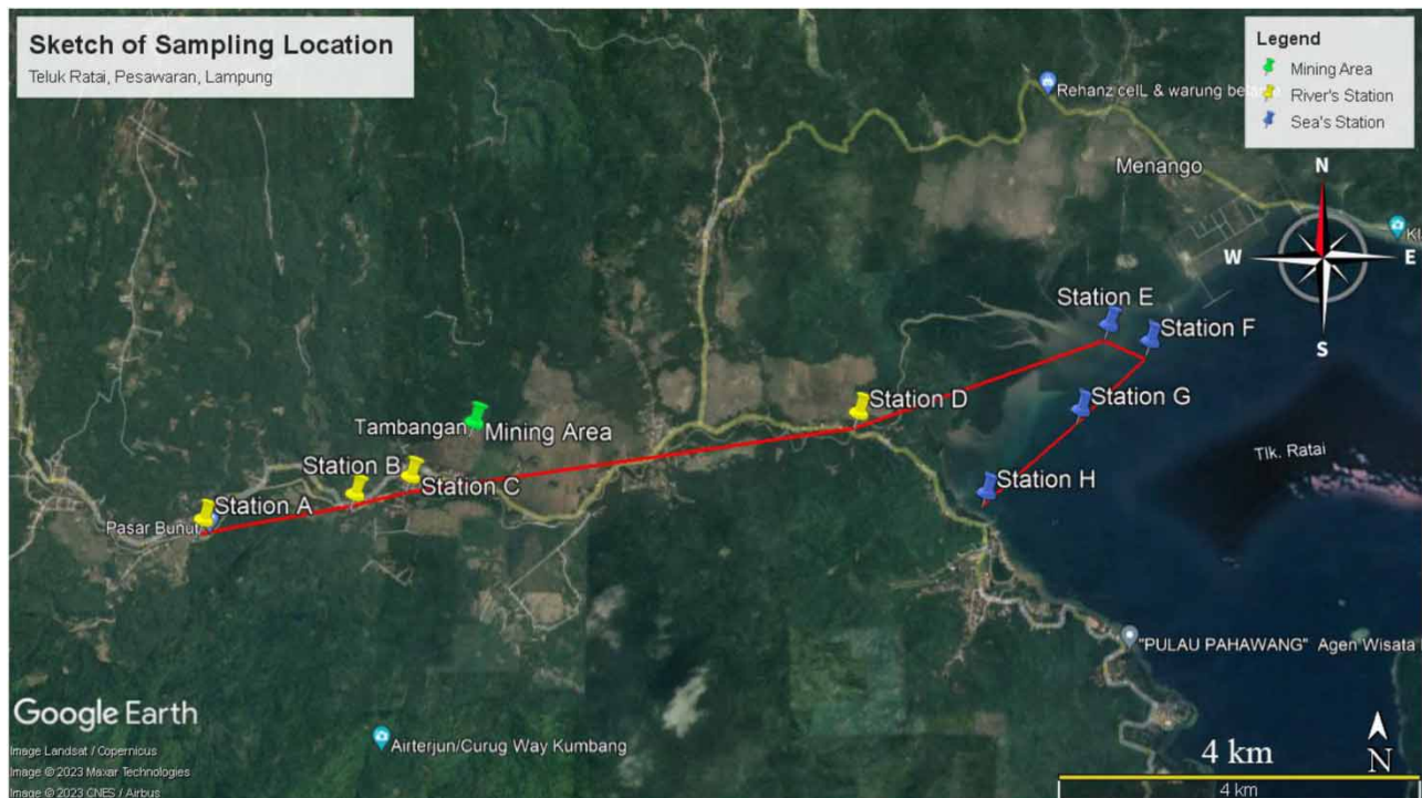
Figure 1 | Sketch of the sampling location.

Plankton net with a mesh of 25 \mu\text{m} was used to collect plankton. Cool box, 600-mL plastic bottle, zipper plastic, filter paper, tissue, test tube, measuring cup, dropper, object glass, microscope, and thermometer were used to collect and prepare samples. Global Positioning System (GPS) was used to determine the coordinates of the sampling location, and ICP-OES