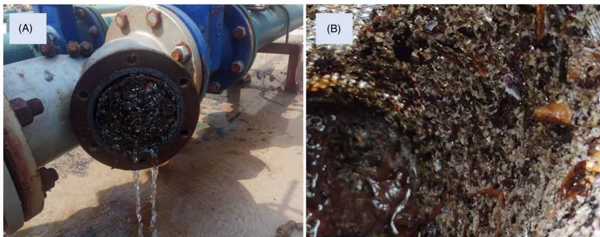
Figure 2 | The fouling problems of water pipes caused by Limnoperna fortunei .

Table 3 summarises the facilities and fouling problems affected by L. fortunei . As early as the 1970s, fouling brought by L. fortunei appeared in cooling water pipes at one of the largest steel mills, the Wuhan Iron and Steel Corporation, in Hubei, central China (Boltovskoy et al. 2015b; Xu et al. 2015b). Mussels clogged the pipes of water supply systems and caused expensive clean-up costs or plants shutdowns. In the 1980s, fouling problems became prevalent, which generally affected the industrial and water transfer facilities. Some water treatment plants, such as the water treatment plants in Suzhou, were even temporarily closed due to pipe clogging caused by L. fortunei (Luo et al. 2006; Boltovskoy et al. 2015b). Similarly, several water treatment plants have also been affected by L. fortunei biofouling problems, including mass attachment of mussels on water screening structures, blocks in strainers and pipes for water quality monitoring, accumulation of dead mussels in settling and flocculation chambers, and blockage of cooling system pipes for intake pumps, in the