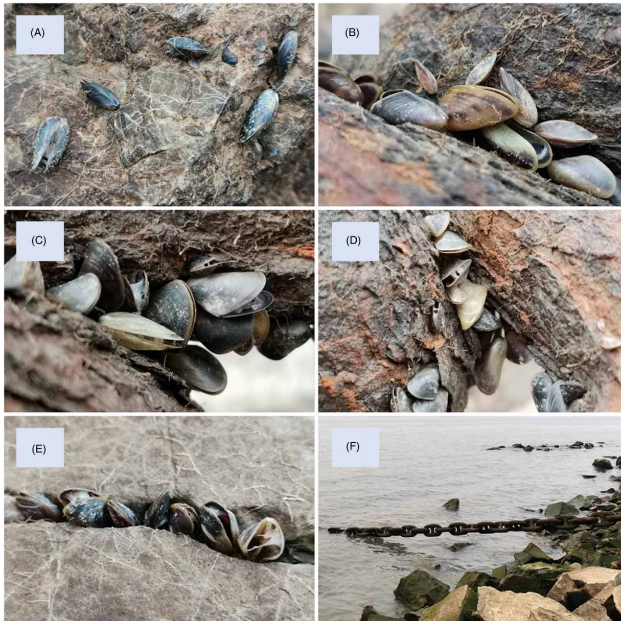
Figure 1 | Limnoperna fortunei attached to the rocks and chains in a riverside (Nanjing, China).