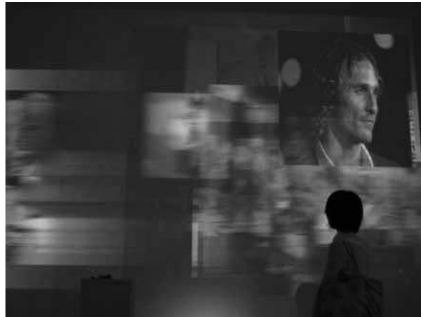
Fig. 1. News pictures blur on the screen. (Exhibition: “Boom! An Interplay of Fast and Frozen Permutation in New Media,” Taipei National University of Arts, Kuando Museum of Arts, Taipei, 2007)

The meanings we receive are only digital signals created by data transformation. In transmission, digital technology analyzes