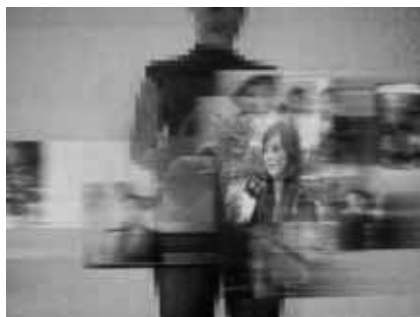
Fig. 2. Participant's image is superimposed with blurred news images. (Exhibition: Imaginary Number "i" in Arts, Kao Yuan Art Center, Kaohsiung, Taiwan, 2006)

When a participant stands in front of the screen, their photo is taken by the web camera and becomes the background of the drifting vision. Participants control the beam of a flashlight into an input coordination signal. The signal mapping into the position acts as the cursor, controlling images and sounds to appear clearly. When the beam is detected and mapped to the cursor on the screen, it is triggered to enlarge the image, stop its movement, allowing clear viewing of it. The system does a loop to check whether the cursor is in the news