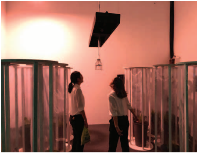
Fig. 1. PlantConnect was exhibited in 2019 at the Asia Culture Center in Gwangju, South Korea, as part of the Arts & Creative Technology (ACT) Festival and the International Symposium on Electronic Art (ISEA 2019).

understanding with the natural world, the project explores complexity and emergent phenomena by harnessing the material agency of nonhuman organisms and the capacity of emerging technologies as mediums for information transmission, communication, and interconnectedness between the human and nonhuman. By staging interactions among human, nonhuman, and machine agencies, PlantConnect contributes to dialogues not only on sustainable futures but also in reimagining the nature of our relationship to the environment and the nonhuman world more broadly. Might we be able to construct experiences using computational intelligence and living organisms that feature what science and technology scholar Andrew Pickering calls a “performative ontology” that does not separate people and (living) things