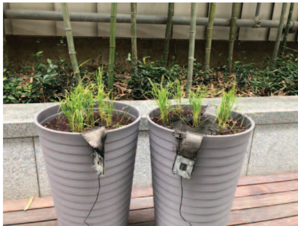
Fig. 4. P-MFCs showing the rice plant, carbon fiber anode and cathode, and waterproof acrylic housings.

While the system is running, the voltage signals in each P-MFC group are analyzed and used to generate a set of dy-