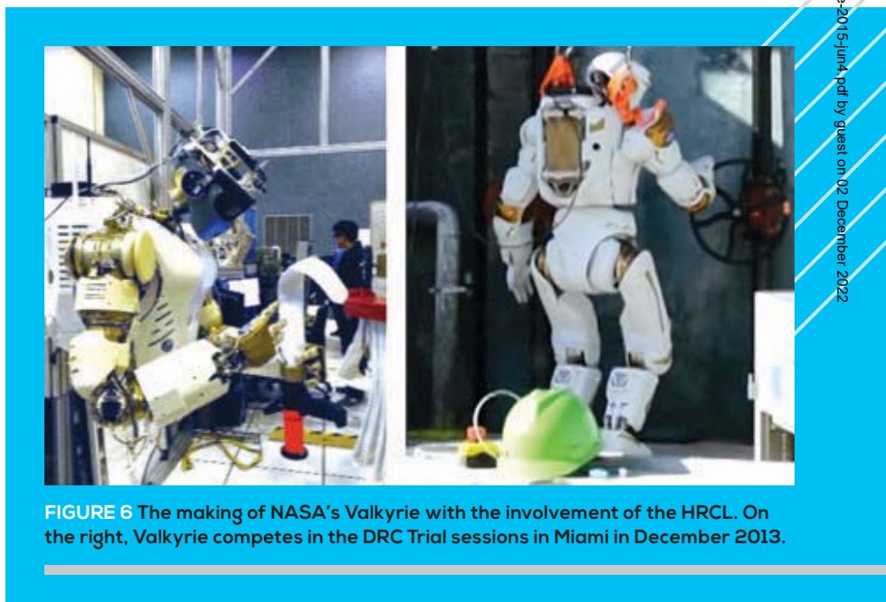
FIGURE 6 The making of NASA's Valkyrie with the involvement of the HRCL. On the right, Valkyrie competes in the DRC Trial sessions in Miami in December 2013.

Whole-Body Operational Space control emerges as a capable framework for realtime unified control of motion and force of humanoid robots. By exploiting the rigid body dynamics of systems, it could theoretically outperform