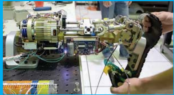
FIGURE 3 The UT-SEA Actuator Concept implemented in NASA's Valkyrie lower leg.

ing because they are relatively simple to build and excellent for testing dynamic balance.