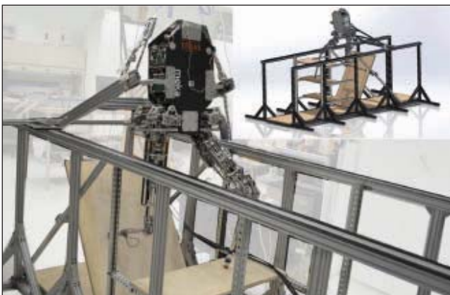
FIGURE 2 The Hume biped robot designed by the Human Centered Robotics Lab and Meka Inc. for mobility in cluttered environments.

Sampling based methods have been successful for slow climbing [Bretl, 2005] and quasi-static mobility in rough terrains [Hauser, 2008] but not fast enough for fall recovery. Point foot robots have been recently able to balance unsupported [Ramezani, 2015, Buss, 2014]. Despite those advancements, we lack a general feedback control and planning framework that is not specialized to one type of agility. We also lack realtime plug and play control middleware for legged robots. In 2012 we started building a teen size bipedal robot, Hume (see Figure 2 ) equipped with series elastic actuators for fundamental studies on agility. Series elastic actuators are a technology developed by [Pratt, 1995] which adds a spring in series with an actuator's mechanical output. Its advantages or disadvantages over more rigid actuators are greatly disputed but there is a consensus that they better protect legged robots against shocks and that they provide better force control at low frequencies than rigid actuators equipped with load cells. Point foot bipeds are very interest-