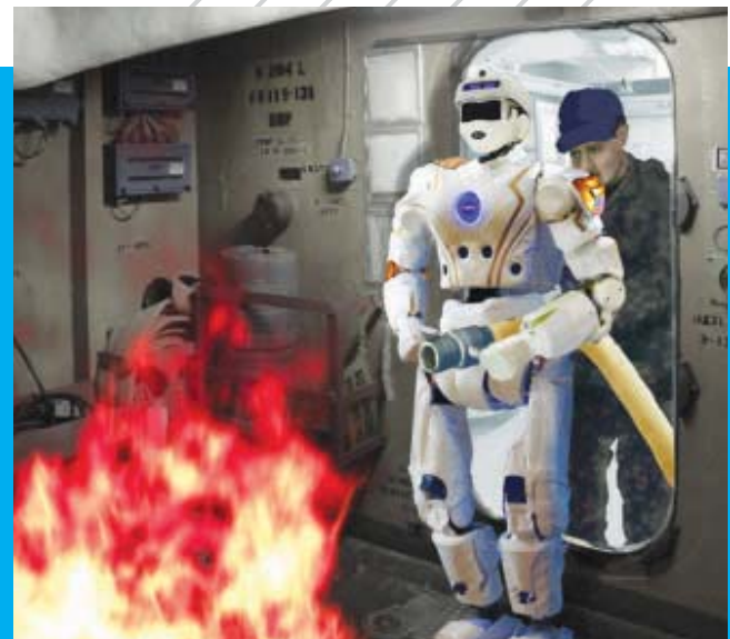
FIGURE 1 Depiction of NASA's Valkyrie humanoid robot working alongside humans in firefighting activities.