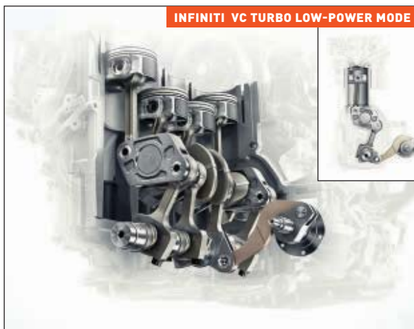
The VC-T 2.0 liter, four-cylinder engine offers variable compression, thanks to a multi-link piston rod. Compound connecting rods are fitted into the crankcase and offer computer control over the ratio of each piston.