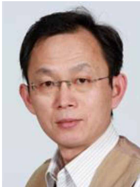
Figure 5 | Chong-Yu Xu, Editor Hydrology Research 2012–2019.