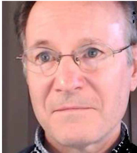
Figure 6 | Nevil Wyndham Quinn, Editor Hydrology Research 2015–date.

Compared to many other journals, the frequency of printing issues of Hydrology Research has been relatively low. This hampered the efforts to increase the journal's impact factor, as frequent publication enhances the possibility to get citations of papers in the narrow window used to calculate the factor. Consequently, it has now been decided to change to monthly