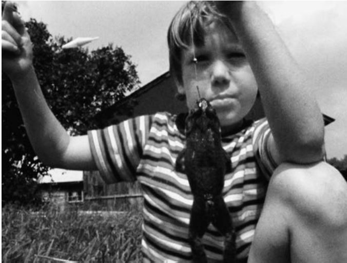
Frampton. Straits of Magellan. 1974.

and mastery, the pleasure of measure .” 27 When confronting larger-than-life figures—this child who morphs into “a mighty hunter,” for example—the audience must adjust, expending cognitive effort on what, before becoming automatic, had to be learned in infancy. This temporary regression to the state of childhood inevitability carries with it some delight. Yet the role reversal doubles as a reenactment of Magellan’s seizure of the indigenous couple, the colonial other represented here as subhuman from the perspective of Magellan and his crew. Frampton also spoke of this scene as his “one-minute horror movie,” and however glib he might have been, the implication is nevertheless present that it critiques the colonial project as the manifestation of infantile urges, as signaling a sort of arrested development that insists on the diminishment of the physiques of others as compared to the colonizers.