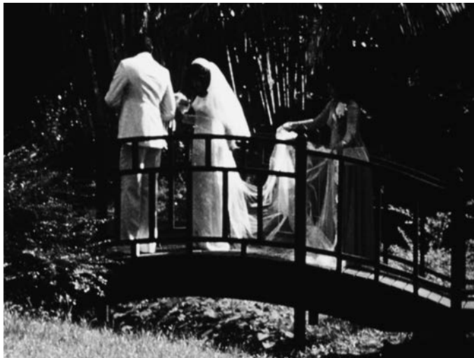
Hollis Frampton. Birth of Magellan: Cadenza I . 1977–80. © Estate of Hollis Frampton.

Magellan opens with the sounds of an orchestra tuning up and images of a lightning storm, insinuating itself into an incipient, primeval setting. After this prelude, it cuts between a scene from a contemporary wedding and a piece of film’s early history, A Little Piece of String (1901). In the wedding video, the spatial arrangement of those in the frame resembles that of String . The groom stands to the left of the bride as another woman holds the fabric of the dress’s train. The latter clip presents a visual gag on politeness. A young man and young woman converse while a second man notices a string dangling from the woman’s clothing. He pulls it until eventually, to his embarrassment, the woman’s dress falls apart. The juxtaposition of these clips in Birth of Magellan suggests not only that the display of sexuality has been integral to the medium since film’s conception but also that the medium itself is a form of striptease in its promise to reveal what it cannot actually deliver. It is thus a proper initiation for a film based on a voyage around the world that contains zero images of such.