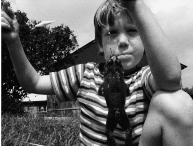
Frampton. Straits of Magellan. 1974.

and mastery, the pleasure of measure .” 27 When confronting larger-than-life figures—this child who morphs into “a mighty hunter,” for example—the audience must adjust, expending cognitive effort on what, before becoming automatic, had to be learned in infancy. This temporary regression to the state of childhood inevitability carries with it some delight. Yet the role reversal doubles as a reenactment of Magellan’s seizure of the indigenous couple, the colonial other represented here as subhuman from the perspective of Magellan and his crew. Frampton also spoke of this scene as his “one-minute horror movie,” and however glib he might have been, the implication is nevertheless present that it critiques the colonial project as the manifestation of infantile urges, as signaling a sort of arrested development that insists on the diminishment of the physiques of others as compared to the colonizers.