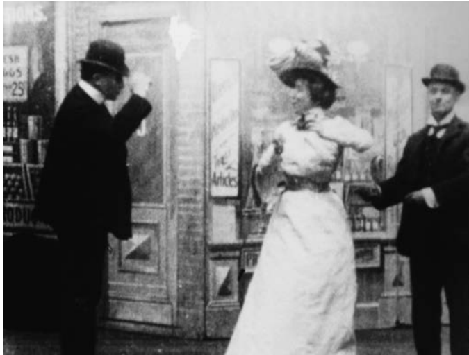
Frampton. Birth of Magellan: Cadenza I. 1977–1980.

A beginning that enacts a return to origins can also be found in The Cantos , but the discrepancy between these returns intimates that Frampton and Pound are conducting two different types of voyages. While Pound stated that “all poetic language is the language of exploration,” beginning The Cantos with a translation of Homer imbues the epic with the feeling that everything has been preordained and has, in a sense, already transpired: “The ocean flowing backward, came we then to the place / Aforesaid by Circe.” 17 The caesura gives the line an antiquated meter, reinforcing its rearward motion by melding echoes of old English verse with the content of Greek epic. The metrical inversions swim against the flow of the line so that the meter inhibits the verse’s progression just as much as it propels it forward. When Odysseus then encounters the shades of his former crew members, this brief surfacing of the underworld makes plain that Pound’s odyssey embarks with multiple acts of excavation.