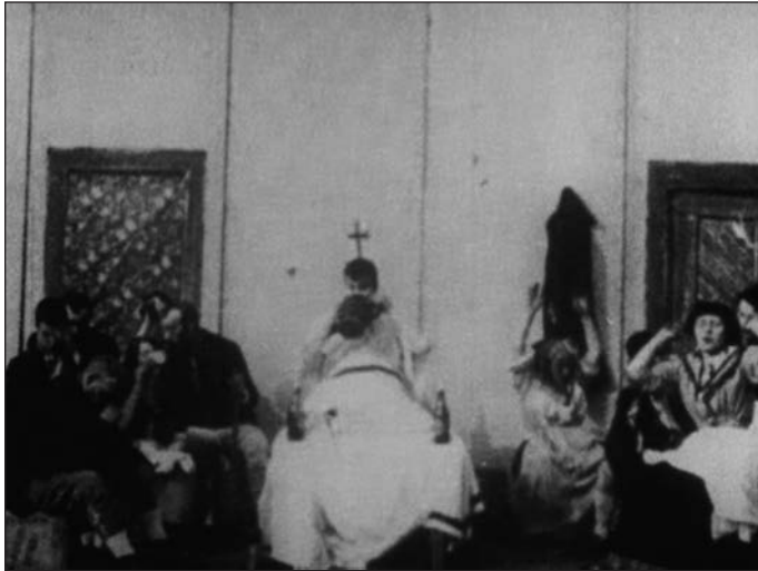
Frampton. Death of Magellan: Gloria! 1979. © Estate of Hollis Frampton.

tradition lies not in the movie theater but in the variety performances and magic shows that interspersed film clips throughout miscellaneous other acts: “When film was very new and was a real novelty you really would find films, little films, shown in the middle of a kind of vaudeville of light.” 45 This vaudeville of light—comprising not only short films but everything from demonstrations of X-rays to see inside the performer to phantasmagoria performances to terrify the audience with spectral images projected onto clouds of smoke—would eventually be articulated within film criticism as the cinema of attractions, giving a belated vindication to the realization of metahistory in Magellan . 46