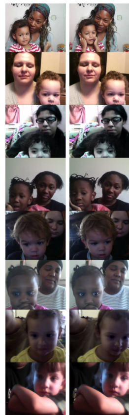
Figure 1. Cropped examples of webcam video frames of children looking to the reader's left (left column) and right (right column).

Each session of the preferential looking study was coded using VCode (Hagedorn et al., 2008) by two coders blind to the placement of test videos. Looks to the left and right are generally clear; for examples, see Figure 1. Three calibration trials were included in which an animated attention getter was shown on one side and then the other. During calibration videos, all