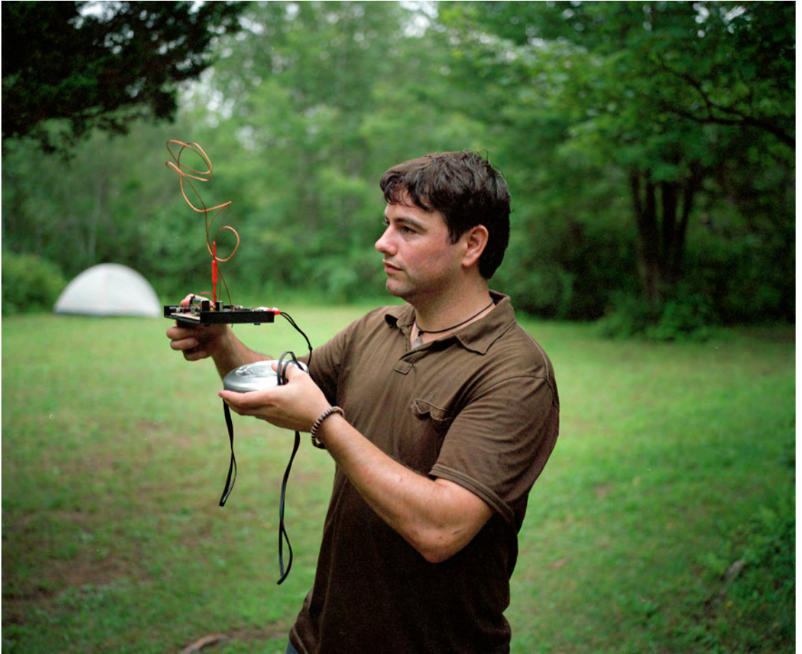
Studies for Radio Transceiver by Matthew Burtner. Performed during the Spectral Garden event at free103point9 Wave Farm, 2006. Studies for Radio Transceiver questions the nature of the radio medium and the role it plays in forming the content of a musical system.