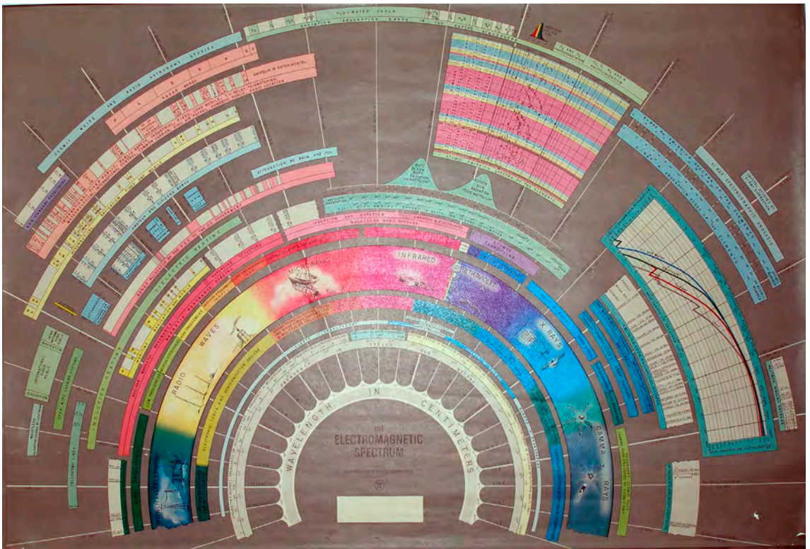
Early electromagnetic spectrum chart produced by Westinghouse Research Laboratories in the early-twentieth century.