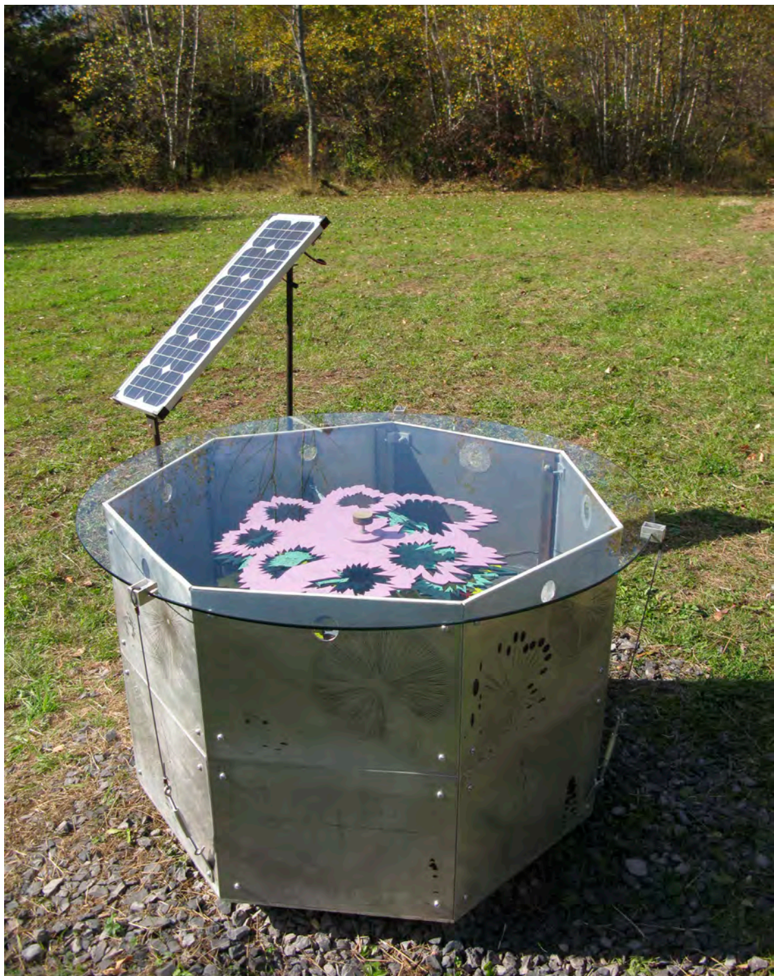
Circular Spectral Analyzer , Cross Current Resonance Transducer (Douglas Repetto and LoVid), 2008. Circular Spectral Analyzer (CSA) fuses signal aesthetics and environmental functionality in a kinetic installation featured in the free103point9 transmission sculpture garden at Wave Farm in Acra, New York. Solar energy powers and tunes a short wave radio while driving the sculpture's motorized elements. The etchings and forms in the sculpture are interpretations of seven months of recorded solar data from seven different locations in NY State.