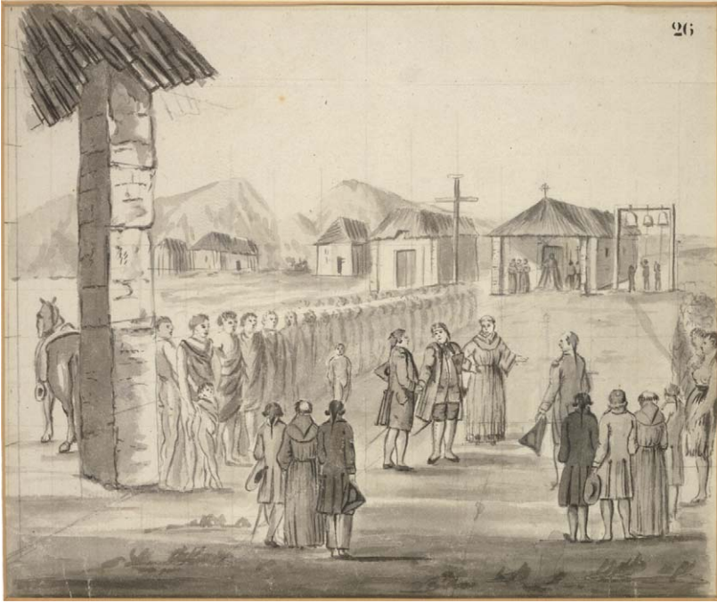
FIGURE 2. Count Jean François de la Pérouse, other visitors, and missionaries observe San Carlos Borroméo Mission Indians standing at attention during a formal inspection accompanied by bell ringing. José Cardero, “Copia de un dibujo que deja el Pintor del Conde dela Perouse a los Padres de la Mision del Carmelo en Monterey [Copy of a Drawing of the Visit of the Count de la Pérouse to the Fathers at the Mission of Carmel at Monterey (in 1786), California],” drawing on paper, [1791–1792]. Courtesy of the Bancroft Library, Berkeley, California.

from dawn to dusk. Like many jailors, Franciscans sometimes lined up California mission Indians for inspection, as depicted above in Figure 2.