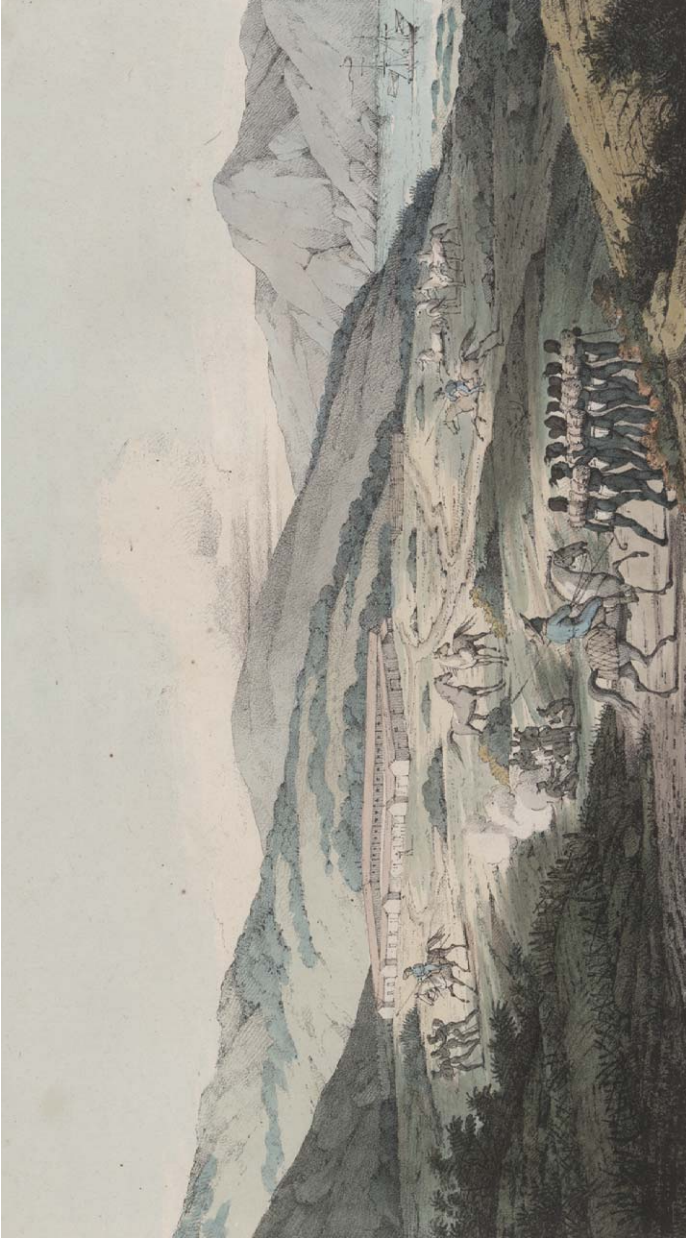
FIGURE 3. In the foreground, a mounted overseer carrying a whip or lance marches ten California Indians north toward San Francisco Bay. To the left, another overseer on horseback drives three California Indians south. Louis Choris, "Vue du Presidio s. n Francisco [View of San Francisco Presidio]," lithograph, c. 1815.