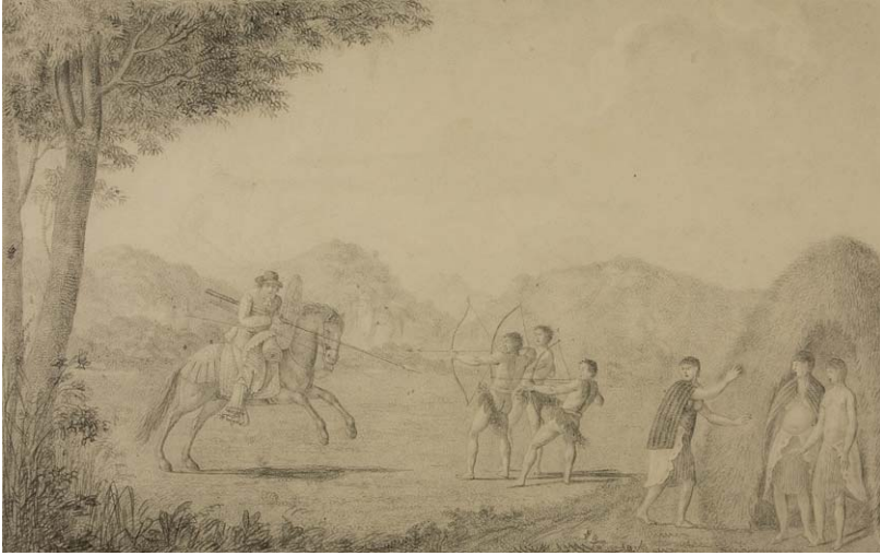
FIGURE 4. This drawing illustrates how Rumsen or Costanoan archers would defend their community from a charging Spanish dragoon. Tomás de Suria, “Modo de pelear de los Yndios de Californias [Mode of combat of the Indians of the Californias],” pencil drawing, 1791.

In response to the rising number of escapees, the state supported increasingly violent recapture operations. In 1797, Spanish soldiers attacked a group of escapees and non-mission Indians, killing seven and capturing eighty-three. 120 Three years later, Sergeant Pedro Amador killed a chief during a recapture and round-up operation. 121 In 1804, Father Estevan Tapís reported, “fugitives are increasing and the only remedy is an immediate increase of military force.” 122 Others listened. In 1812, an expedition from missions San Francisco and San José attacked escapees and their allies, leaving “many dead.” 123 In 1829, the Mexican soldier Joaquín Piña recorded how his unit attacked escaped California mission Indians, killing perhaps thirty or more people, including male and female prisoners. 124 The following year, a Mission San Rafael priest ordered some escapees recaptured, enlisting the